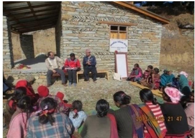
CAC members deliberate in the meeting

The LGCDP Social Mobilisation programme was started in Baglung Municipality on 2068/69. A Ward Citizen Forum was formed at the ward level. Similarly based on the socio-economic analysis of the ward, Malika Tol was selected for the establishment of the Citizen Awareness center. Women of the settlement united in a CAC ( right ) and started meeting every Saturday. With the help of a social mobiliser, and using the ReFLECT process, they identified and prioritized the major issues and