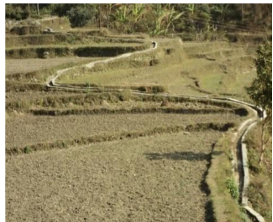
View of the irrigational canal

headquarters, or are compelled to go abroad as crude laborers to sustain the family needs. Sometimes, cropping is not possible due to an absence of rain and the majority of the population faces grave shortages in cereal grains leading to potential starvation.