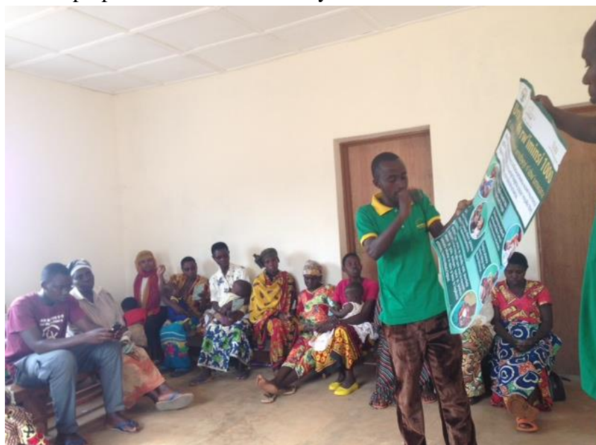
IPC done by CBO in Ngoma Districts, March 2015

In these IPC sessions, the audience was composed of care givers of children under five years of age and pregnant women. Key messages focused on (i) feeding on a balanced diet during pregnancy, (ii) exclusive breastfeeding for six months, (iii) keeping proper hygiene, (iv) immunizing your child against preventable diseases, (v) balanced diet and composition of a complete diet, and (vi) knowing how to prepare nutritious food for your child.