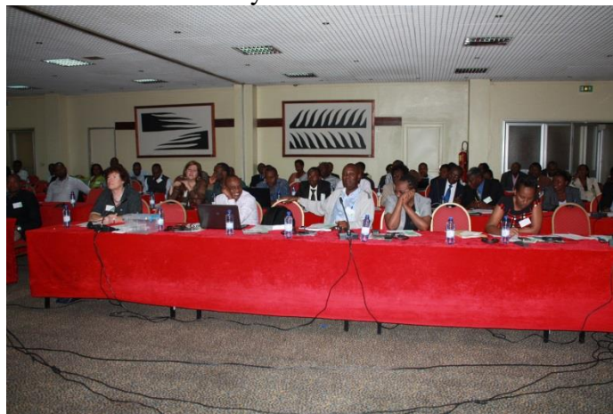
Participants in the SUN general Assembly

On March 25, CRS, together with partners, facilitated the organization of the first SUN CSA in Rwanda General Assembly meeting which established the Scaling Up Nutrition Civil Society Alliance (SUN CSA) in Rwanda. Fifty-nine civil society organizations working in nutrition participated as founding members of the Alliance, supported by stakeholder representatives from the government, academia, donor organizations, and the private sector. During the meeting, participant members validated the Alliance's Terms of Reference and elected an Executive Committee. The new committee is comprised of Society for Family Health as Chair, Catholic Relief Services Rwanda as Co-Chair, and Catholic University of Rwanda as Interim Secretary.