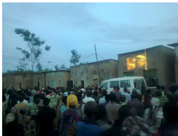
Mobile Video Unit show

Mobilization sessions were done in Nyabihu district, Jenda and Kabatwa sector, Rusizi district Bugarama sector, and in Kirere district and Kirehe sector. An estimated number of 5,352 people were reached with nutrition messages during community mobilizations