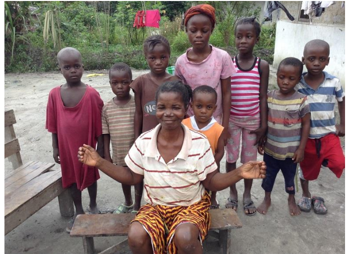
Grand Mother and her 4 grand Children and their friends during the visit. All the children received the one-time cash grant