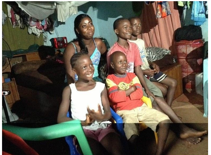
A widowed survivor and her children. They benefited from the cash grant.