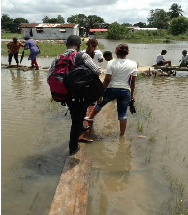
EVD affected family was forced to move to the swamp after the Father died