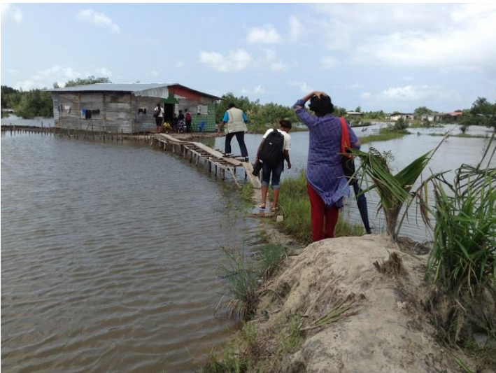
Social Workers making their way to an affected family