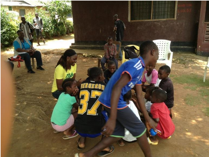
Children at the recreation for resilience activity in Margibi County.