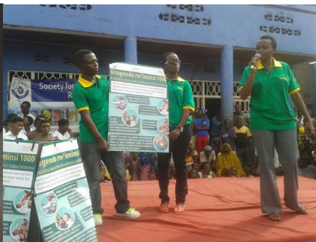
Mobilization Event before the mobile video show