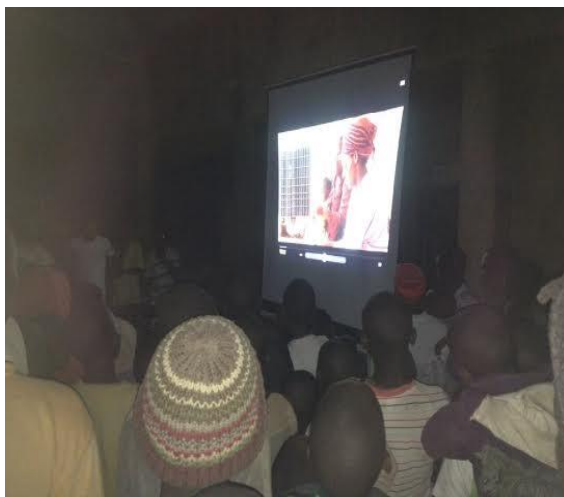
Mobile Video Unit show

Before the mobile video, mobilization events communicating the messages on nutrition, and sessions informing the audience about the time and venue of the MVU session were carried out during the day and MVU in evening of the same day. The key points in implementation of all these activities involved community based organizations, local stars or artists and stakeholders including participation of local leaders in the event.