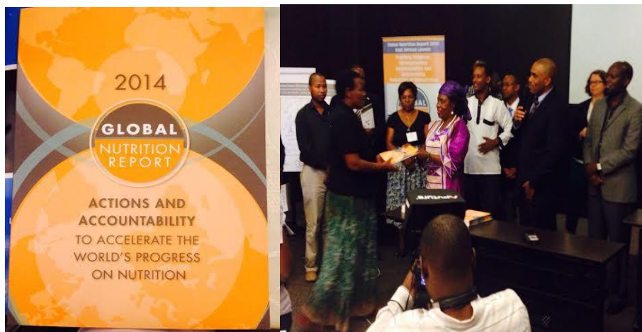
The pictures above were taken during the Global Nutrition Report Launch Meeting

coordinator to follow up regularly on SUN activities and operations; and to continue to collaborate with other stakeholders locally and internationally.