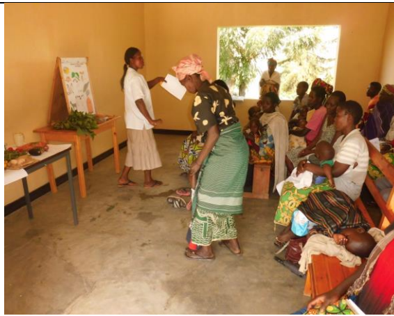
IPC done at Health center in Nyanza Health center, Butare District