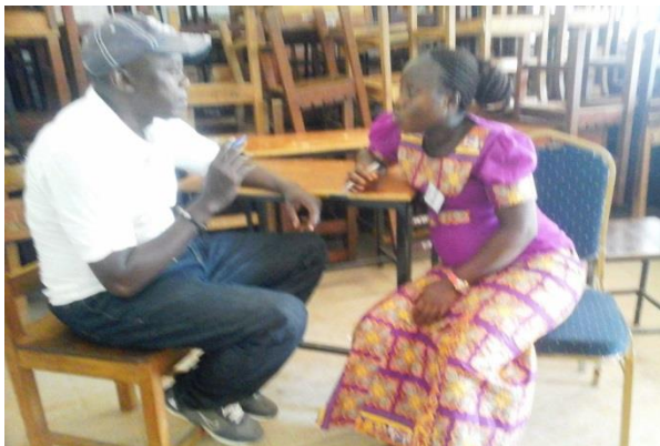
PSS coach in Bo in active one to one counselling session.

On BDS service providers, Restless Development will be engaged to train volunteers from the western area, AFFORD who will train volunteers from the Northern Province and CEPAD who will take the responsibility of training volunteers from the south and Eastern province .The next step is for the partners to develop an evaluation tool for learning assessment of trainees, develop a standardized training curriculum, budget breakdown and to develop a strategy to in cooperate individuals with very low literacy level. SLRCS will clarify literacy level of volunteers under the category of no schooling and to forward recent participants breakdown to other partners.