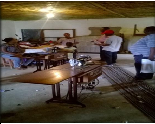
Red Cross team verifying training institutions

from volunteers who opted for vocational skills. These acceptance letters were used by the verification team members to access all the institutions. All the indicated institutions were visited and discussions were held with the heads/principals/proprietors and other key staff. Verification of the institution was carried out based on the following: