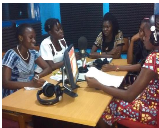
Figure 3: Western Area urban district coordinating body engages children to talk about nutrition and health

In August 2015, a Memorandum of Understanding was signed with a popular radio station, Universal Radio for a weekly programme called “Leh We Tok” which aired every Friday from September to December. This interactive programme engaged the public/communities on various topics related to nutrition, health and community ownership of health services, promoting access and utilization of nutrition and health services by the most vulnerable members. Leh we Tok had programmes on exclusive breastfeeding, infant and young child feeding, malnutrition, the Polio campaign and Global Health Day. Reports from various districts across the country were used to inform the public on issues requiring community action.