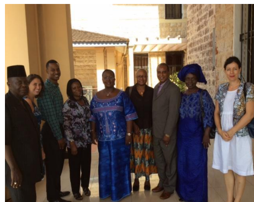
Figure 2: Platform representatives meet with the First Lady for nutrition and immunization