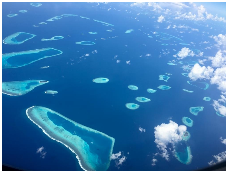
UN Photo Shoko Noda