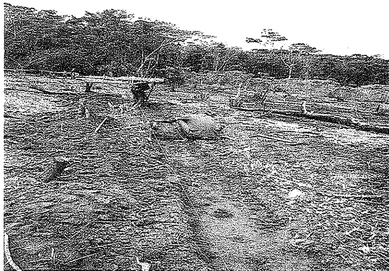
Layout of foundation for fence wall