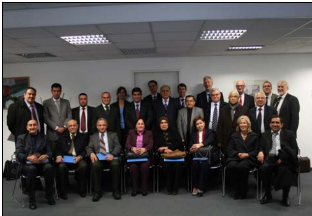
Iraqi Delegation & UN team in Berlin during the Land Management Study Tour in Berlin facilitated by UN-HABITAT