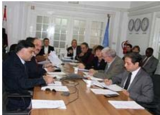
Iraq UN Country Team signing ceremony to establish new Iraq UNDAF Trust Fund.

Of the total un-allocated balances remaining with the UNDG ITF account as of 31 December 2010, $2.1 million will be returned to the European Commission and $35,017 to Germany whose internal rules and procedures do not permit the transfer of contributions. The remaining balance of $2.6 million, from the contributions of 23 donors, was transferred to the new Iraq UNDAF Trust Fund. Subsequent accrual of interest and return funds will be transferred following the same procedures on a regular basis. The transferred funds to the Iraq UNDAF Trust Fund will be used to support priority UNDAF programming where gaps in available resources exist.