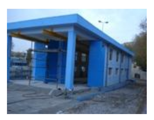
Construction of Chlorine hall