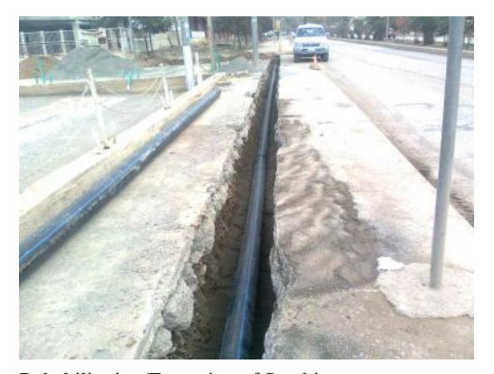
Rehabilitation/Extension of Sarchinar quarter water network

Rehabilitation/extension of the Bakhtiary quarter water network benefiting 40,000 people, and rehabilitation/extension of Sarchinar quarter water network benefiting 20,000 people were completed and contributed to the improved access to safe water.