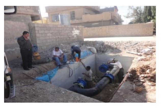
Construction of valve chamber for Sarchinar trunk pipes

Output 1.2: A water quality laboratory established within the Sarchinar water project and is operational.