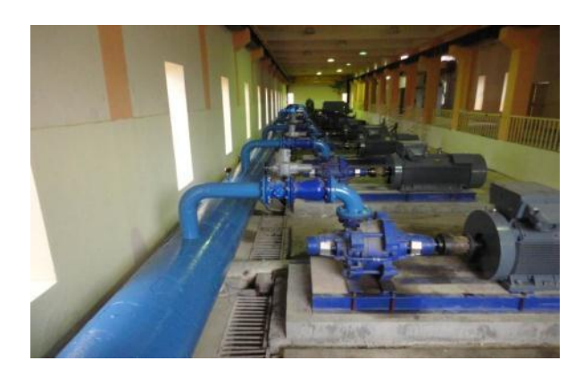
Installation of variable speed pumps in Sarchinar water project

The physical rehabilitation of electro-mechanical work and upgrading the mechanical and electrical installations of Sarchinar water project were finalized based on the international pumping expert's recommendations. Necessary spare parts were procured and delivered to SWD.