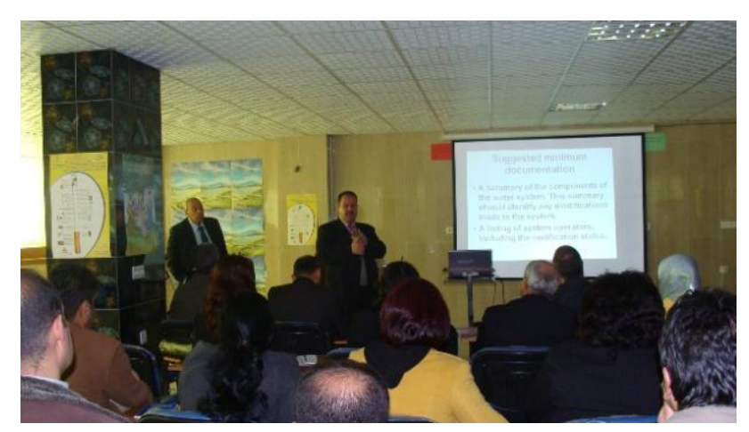
ToT for water quality laboratory technicians/ Sulaymaniyah

During the reporting period, a five-day training of trainers course was conducted by WHO on chlorination techniques for 12 technicians from the SWD. The 12 trainers have previously conducted training for more than 500 operators and chlorine technicians in the three northern governorates (Sulaymaniyah, Erbil and Dohuk).