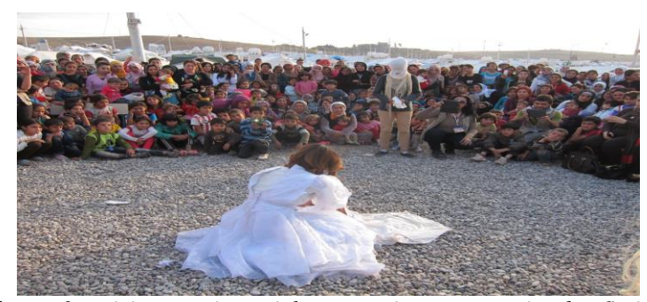
IBHR attending the 16 days of activism against violence against women in the Syrian refugees camp in Erbil

Regarding the addressing of cross-cutting issues, the project has played a strong role in advocating to all the beneficiary institutions the importance of having a gender balance at senior levels inside the organisations whilst all trainings and events were imposed the 30% minimum female participants policy of UNDP. In the future it is anticipated that all three components will become cross-cutting issues within UNDP; human rights, participation and accountability, transparency and anti-corruption. Within the context of the human rights component, the issues of gender were addressed at two levels. The first was through the selection criteria adopted for the formation of the Commission itself (5 women Commissioners out of 14), and the second was through the actions of the Commission to address gender equality as a human rights issue. It will be imperative that the Commission continues to embody the principles of equity it purports to defend. This aside, Youth and Women were provided targeted workshops during the National Anti-Corruption Strategy Campaign and many of the CSO grants awarded were for projects with a strong gender and youth dimension.