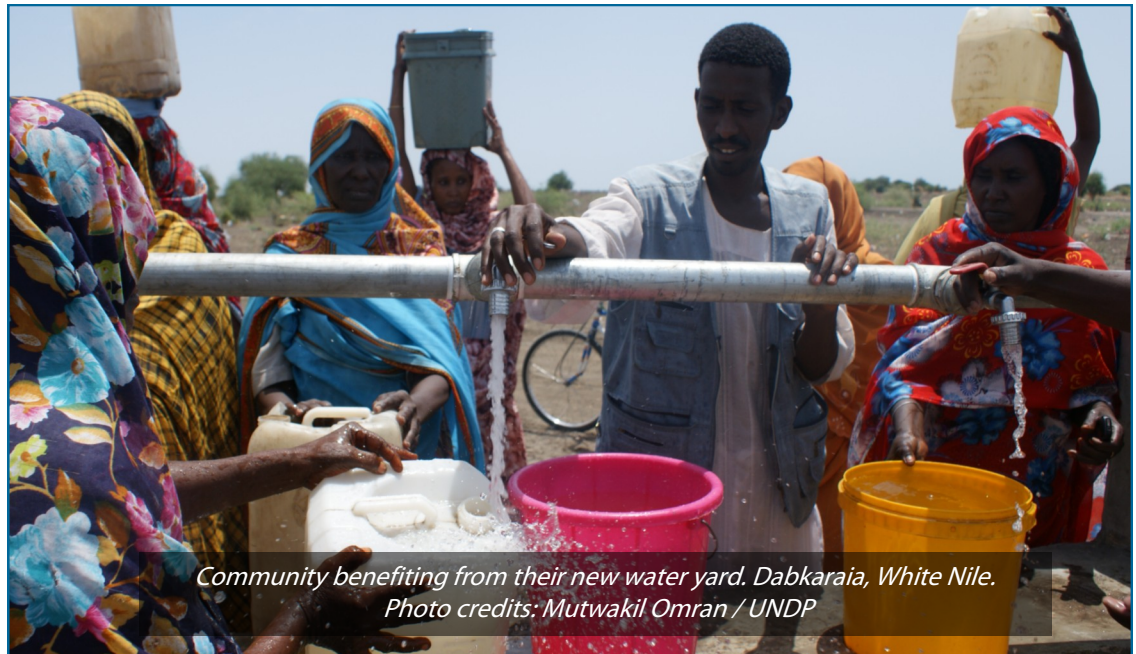
Community benefiting from their new water yard. Dabkaraia, White Nile.