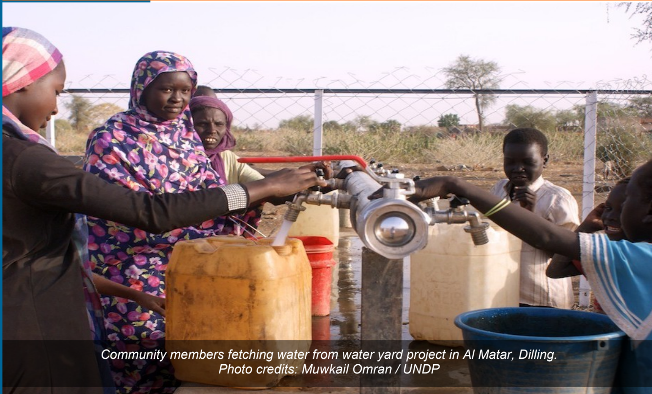
Community members fetching water from water yard project in Al Matar, Dilling.

Al Matar Community, in Dilling, has experienced a time of continued upheaval and conflict as they witnessed deadly clashes over water and pasture. Migrant camel rearing pastoralists - Shanablaa and Beni Jarar tribes – from North West Kordofan started to graze together with residing Bagara tribes in the same locations. This led to overgrazing and an accompanied sense of antagonism over water resources.