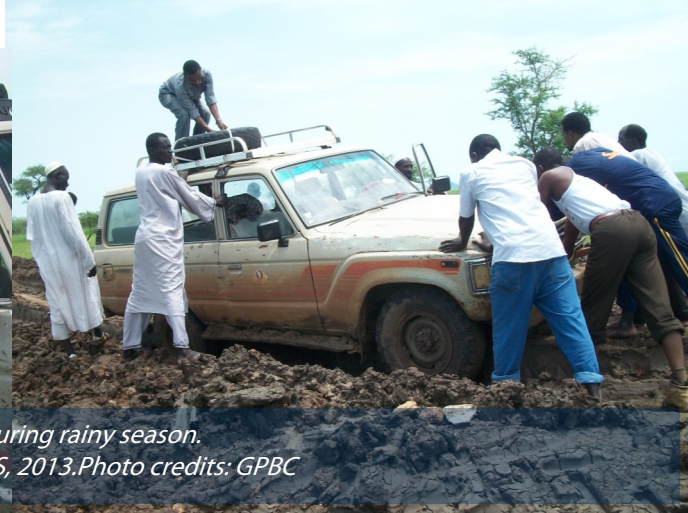
Road troubles during rainy season. On the way to Agadi, BNS, 2013.