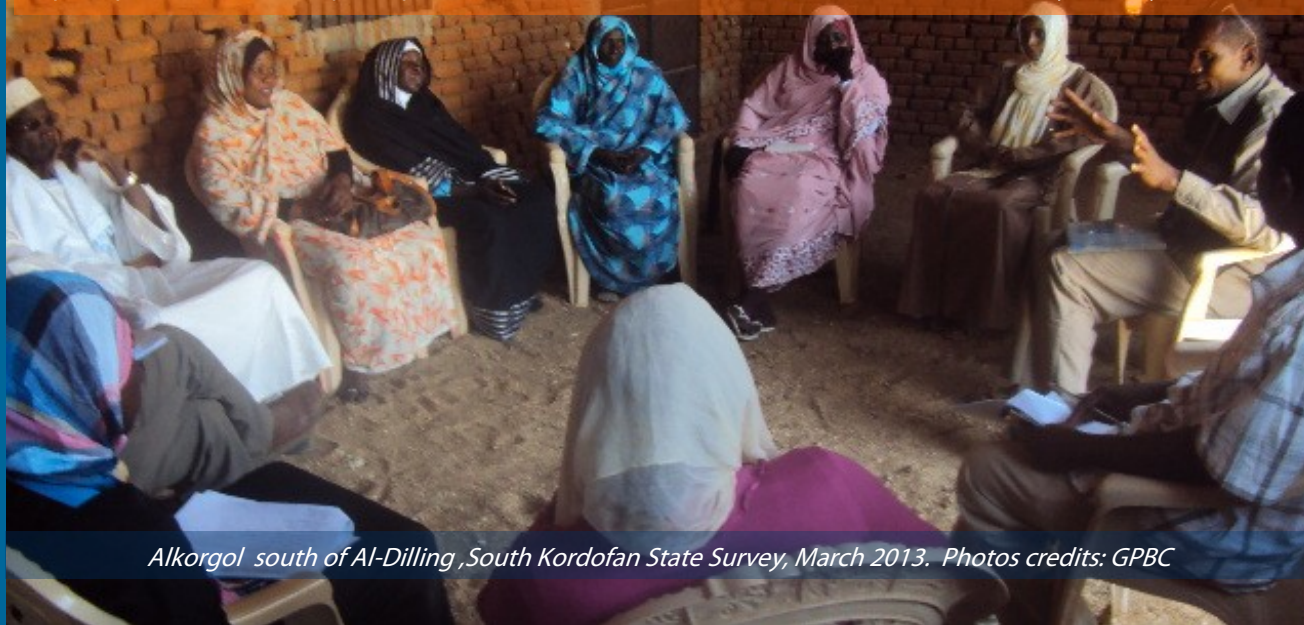
Alkorgol south of Al-Dilling, South Kordofan State Survey, March 2013.

Community Perception Survey (CPS): goal is to assess the awareness of the community about DDR, CSAC and perception towards DDR participants in the communities as well as feedback on community security activities.