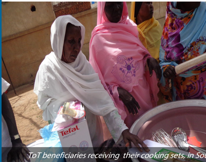
ToT beneficiaries receiving their cooking sets, in South Kordofan.

Another participant shares: "At the beginning of the training of trainers in food processing, I was not sure about how I would deal with women who are diverse and coming from different backgrounds. They were clearly divided, which adds to the challenge. Some of the XCs were members who belonged to opposing sides during the war. Others were civilians, who were not comfortable studying together in the same room with XCs. Could you imagine bringing people who fought in a war against each other into one room to study? I was personally in doubt, but, by the end of the training, participants forgot their political affiliation, their tribal belonging, and all differences, they came together as women, who shared one thing: an eagerness towards learning and improving their lives. They discussed and shared experiences, they laughed and cried together; it was not only food processing but also life processing (...). The training increased openness, social trust, and solidarity amongst participants and I'm very proud to have been part of that transformation."