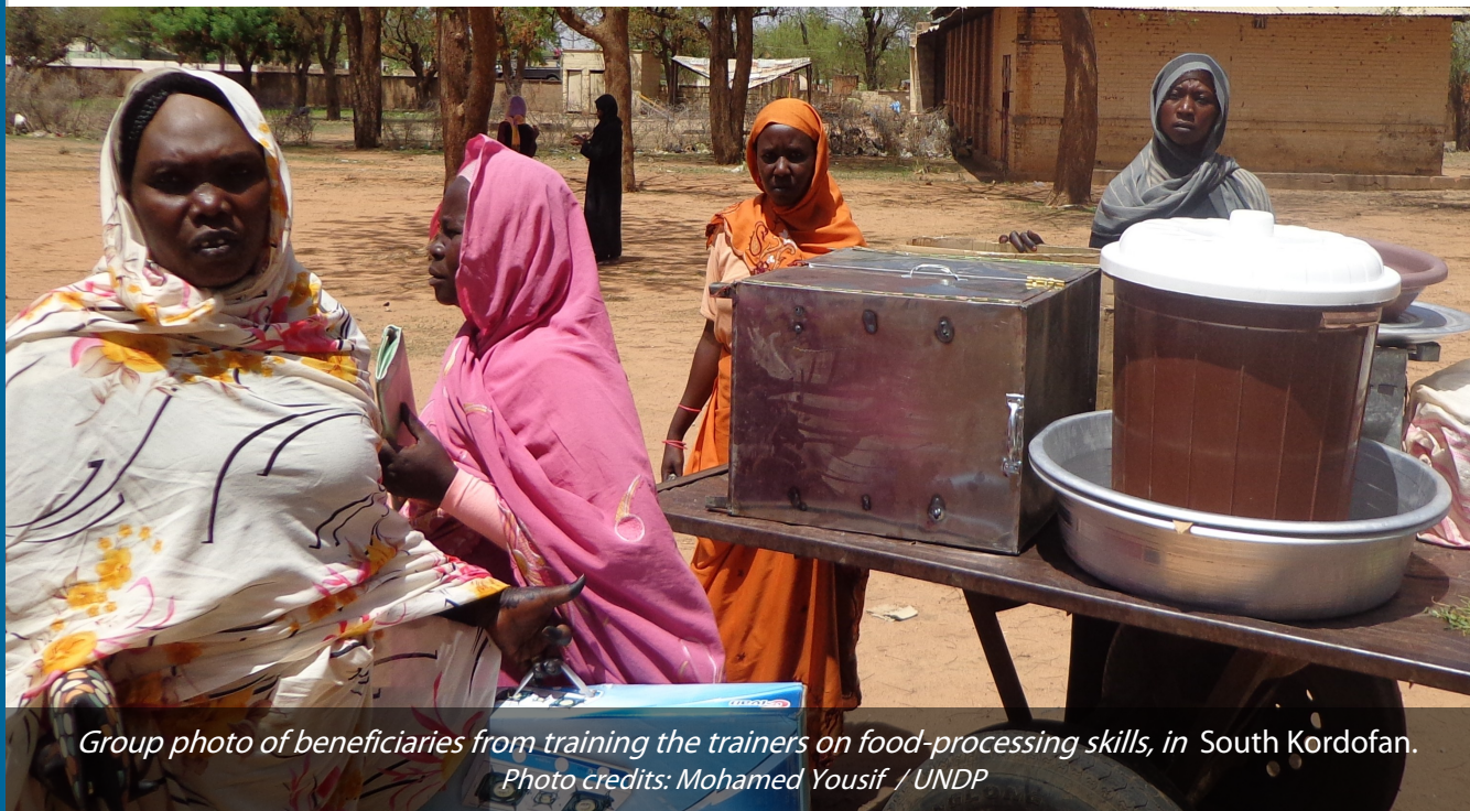
Group photo of beneficiaries from training the trainers on food-processing skills, in South Kordofan.

These trainings use the REFLECT approach, designed for adult education. It consists of participatory learning circles which promotes discussions and questions amongst each other. Peace building activities are designed to use the communities' heritage of arts and folklore to strengthen social cohesion and bridge any gaps amongst the communities. The women's circles will be soon be provided with cooking sets to promote the sustainability of their activities.