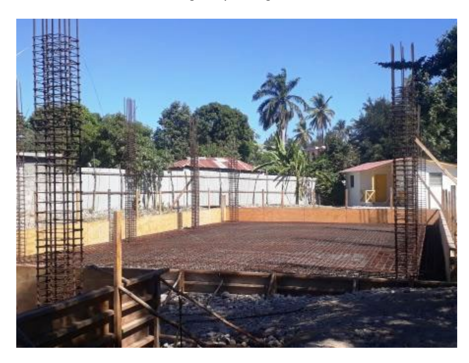
Finished reinforcement awaiting the pouring of concrete