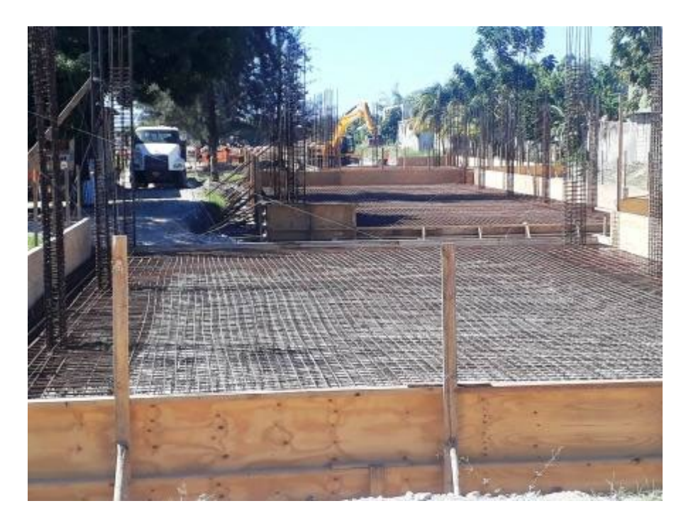
Finished reinforcement awaiting the pouring of concrete