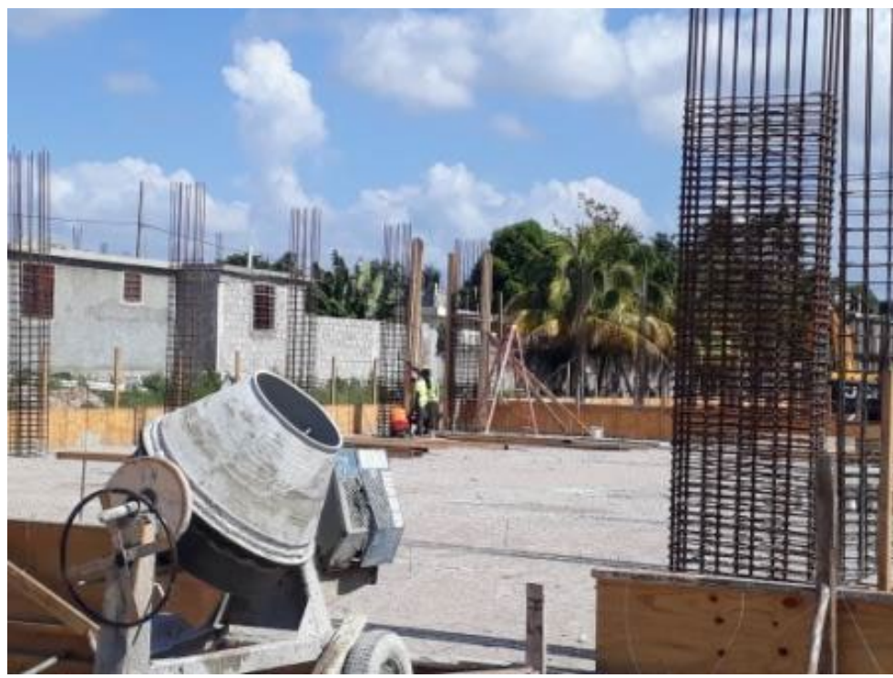
Les Cayes Works – Feb/2020