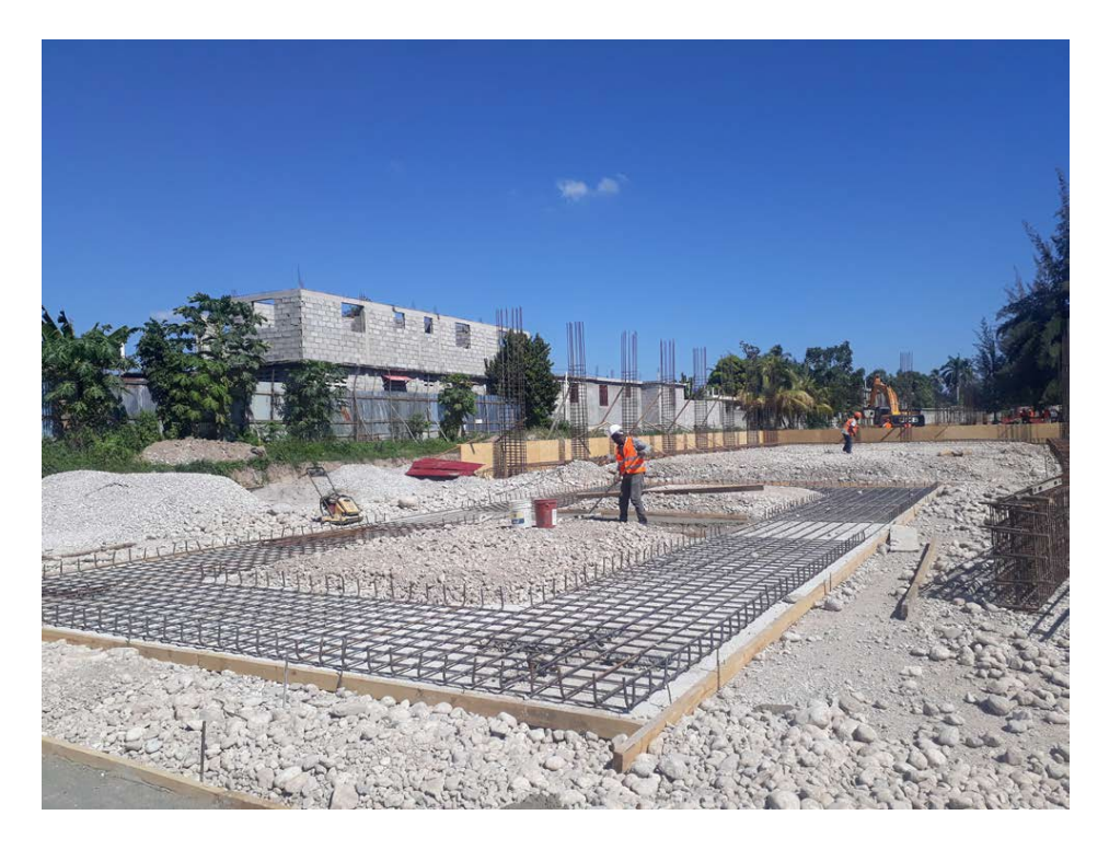
Finished reinforcement awaiting the pouring of concrete

Putting in place concrete of cleanliness and starting of the reinforcement