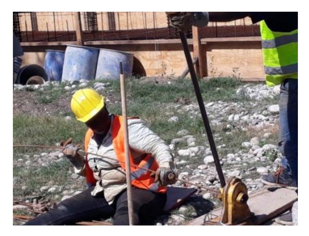
Les Cayes Works - Feb/2020