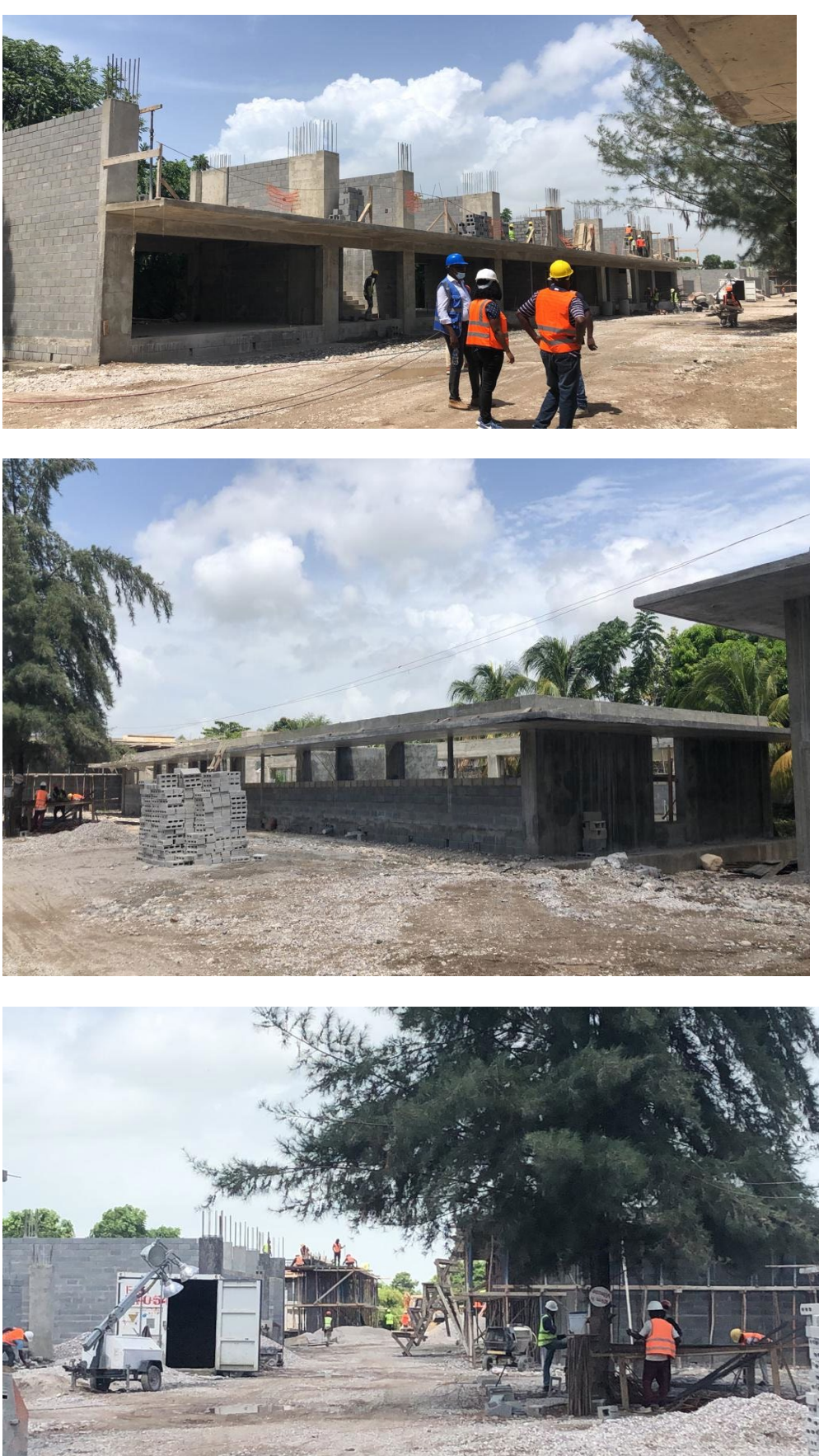
Les Cayes Work – Early 2021