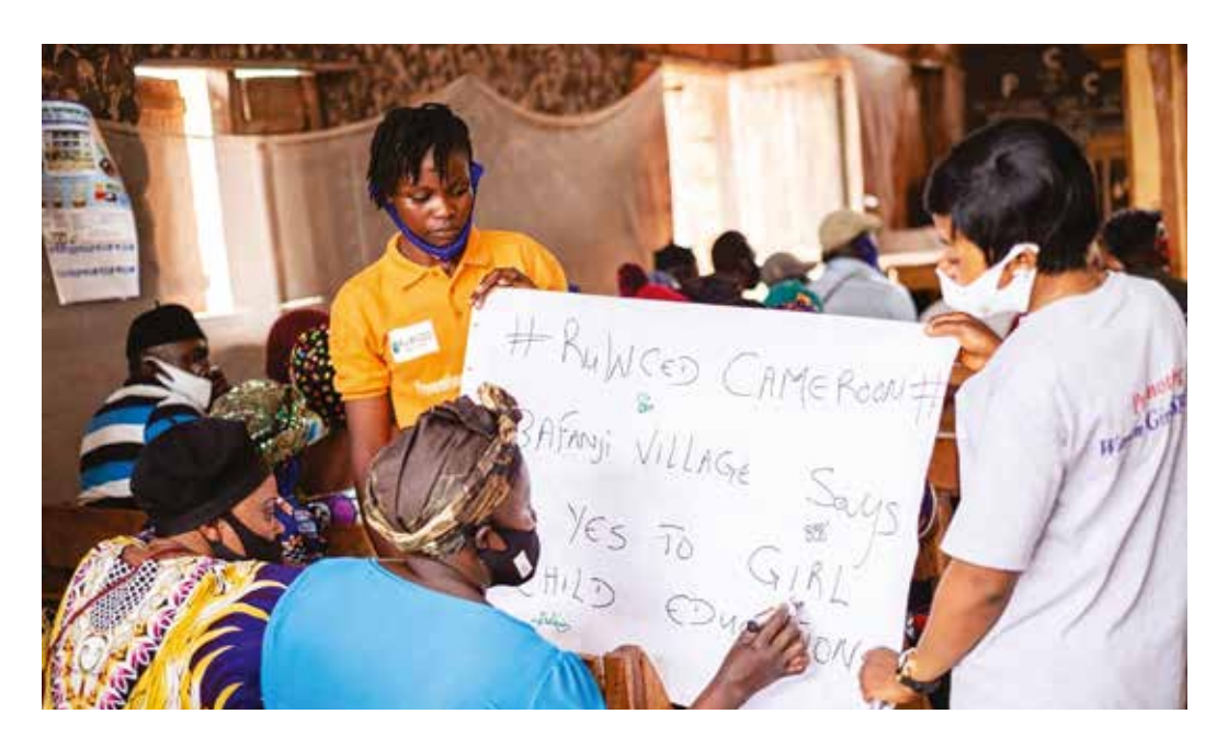
Parent-children dialogues to encourage exchange of ideas on girl child education in Bafanji.

activities to be delayed." Another grantee echoed this, saying: "Flexible funding is valuable to our organization because it allows us to respond to changing needs and use funds in the most efficient and effective way." Integrating these lessons in the UN Trust Fund's work, the 26<sup>th</sup> regular call for proposals reflects a commitment to continued support for institutional strengthening and organizational resilience, with a special focus on protracted and overlapping crises.