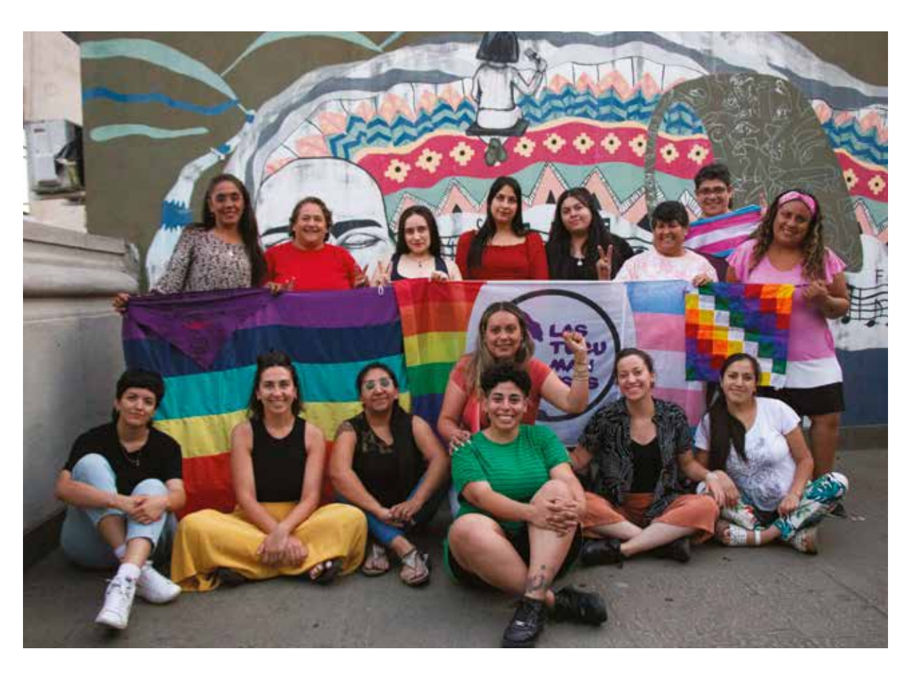
On-site workshop in Tucumán, Argentina, in 2021.

Throughout 2022, Spotlight Initiative grantees continued to be featured across all social media channels of the UN Trust Fund in the form of quote cards, links to case studies and interviews (see Annex D for a full breakdown of social media posts). Projects of UN Trust Fund grantees under the Spotlight Initiative were featured as case studies on the UN Trust Fund's website. On UN Trust Fund's Medium platform, interviews with Spotlight Initiative grantees not only highlighted their work in preventing and ending VAW/G, but also underlined their insights on feminist movement building and how donors could better support feminist and women's movements. Below is a selection of quotes from grantees: