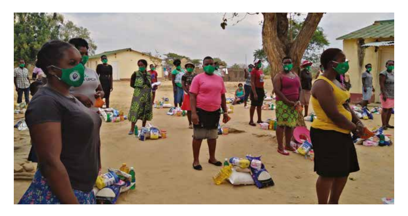
PPE, food and hygiene packs distribution to female sex workers at Mushaninga Hall Kadzere, Zimbabwe.

Building on the extended reach of the UN Trust Fund's external communications channels, in parts thanks to newly cultivated partnerships for joint ending VAW/G advocacy, the UN Trust Fund will continue to amplify the voices of CSOs/WROs and the women and girls they serve through creating spaces for interventions, campaigns and intensive social media actions. The UN Trust Fund will also build on lessons learned from successes in external communications activities in 2022 to strategically disseminate key messages within the framework of the Spotlight Initiative, particularly Outcome 6, to demonstrate how CSOs/WROs-led work can make transformative changes.