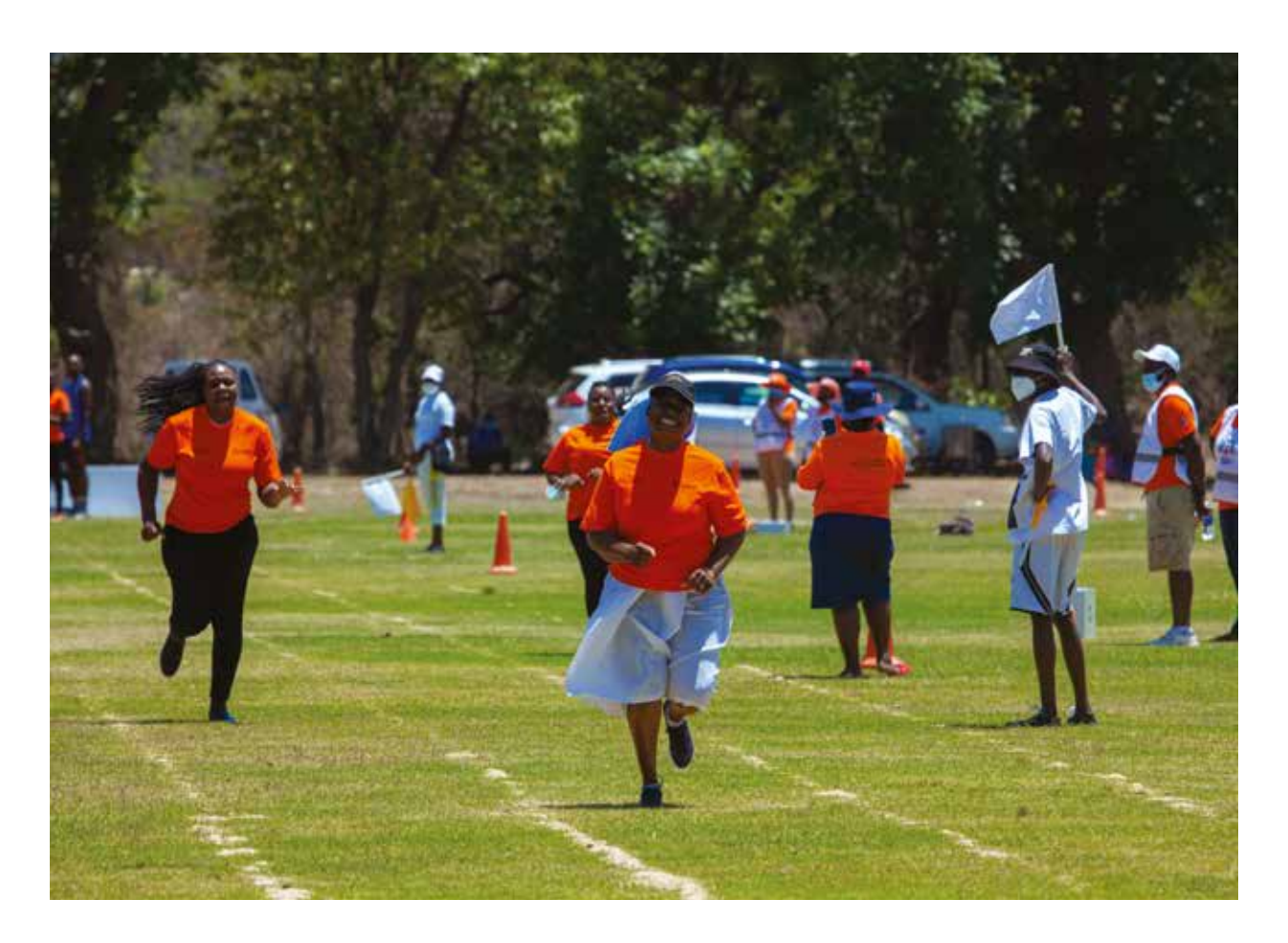
A Roman Catholic nun takes the lead at the stakeholders' fun run during the 16 Days of Activism against Gender-Based Violence marathon in Zimbabwe.

The focuses of these discussions were based on specific contexts and determined by grantees' interest and experiences and how institutional strengthening contributed to organizational resilience that enabled grantees to address the needs of women and girl survivors of violence more effectively and in a more timely manner.