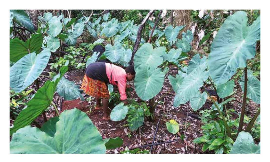
One of the project's participants on her cocoyam farm in Djibot, Cameroon.

It was still not possible to conduct monitoring missions at the start of 2022 due to COVID-19-related travel restrictions. However, these were deferred and took place later in the year. UN Trust Fund staff then undertook missions to visit grantees to Eswatini Kenya, Mexico and South Africa, visiting a total of nine grantees in receipt of Spotlight Initiative funding. The missions enabled the UN Trust Fund to validate the results and the financial management, implementation results-based monitoring and evaluation (M&E) reporting and to assess the human and operational capacities.