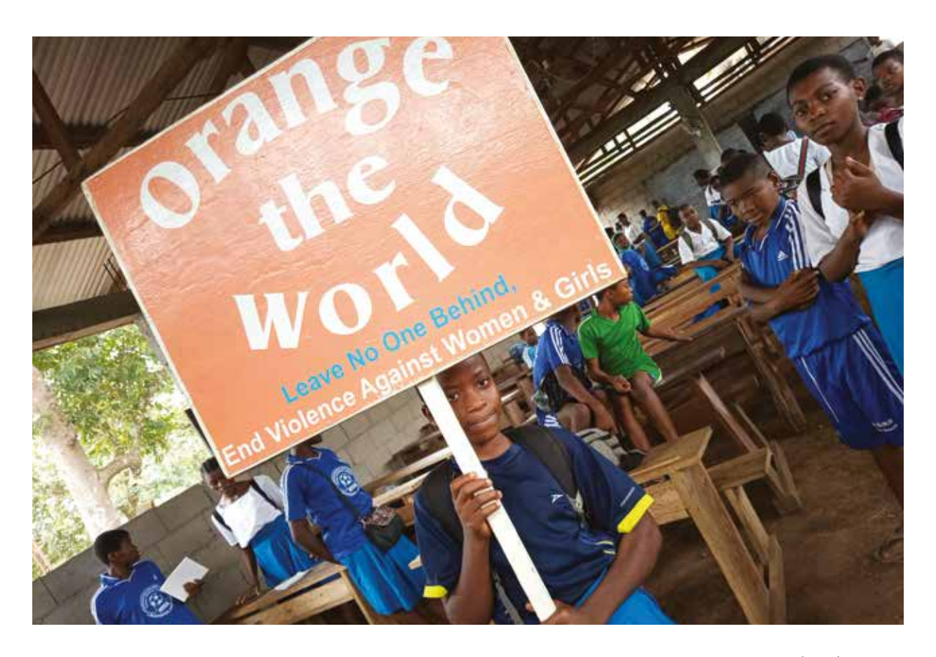
Awareness-raising on gender-based violence.

A woman beneficiary of the project led by the Institute for Young Women Development (IYWD), Zimbabwe