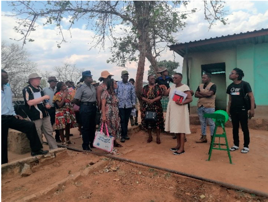
Tour of a GBV Shelter in Umzingwane as part of the Spotlight Civil Society Reference Group Field Monitoring Mission