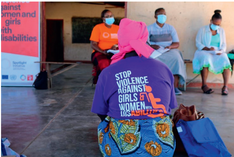
Capacity Building Initiatives for people with disability under Leonard Cheshire Disability Zimbabwe (LCDZ) for building a more inclusive society.