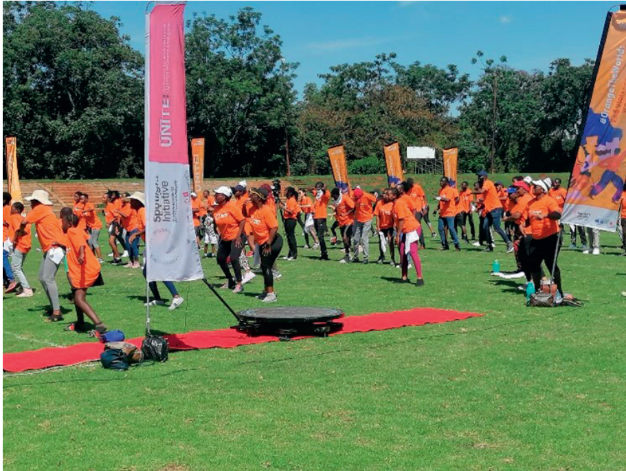
Participants at the #ShakeOffGBV campaign held in commemoration of 16 days of Activism against GBV.