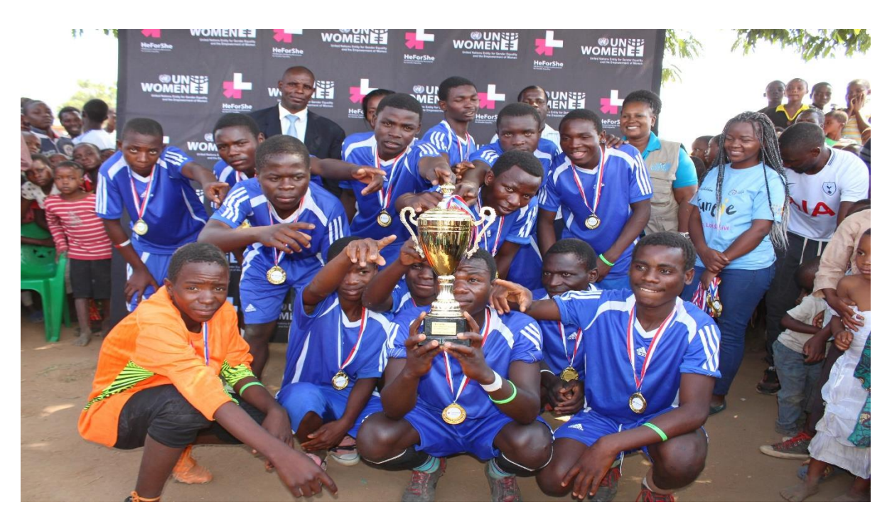
Group photo – The Chimbiya primary school football team with their branded JPGE HeForShe trophy and medals. - Dedza, 2017: Courtesy of Lusungu Jonazi- UN Women, 2017

Another innovative engagement was UNICEFs partnership with Standard Bank. Through this partnership, Standard Bank mentored 100 girls from school around Chimbiya Zone. A mid-year review of the initiative indicated that the mentorship had achieved the desired result among girls as now they were more motivated to remain in school and they aspire to be like the mentors they have engaged with. Apart from the sessions, Standard Bank also provided exposure to girls by giving them educational visits to Lilongwe.