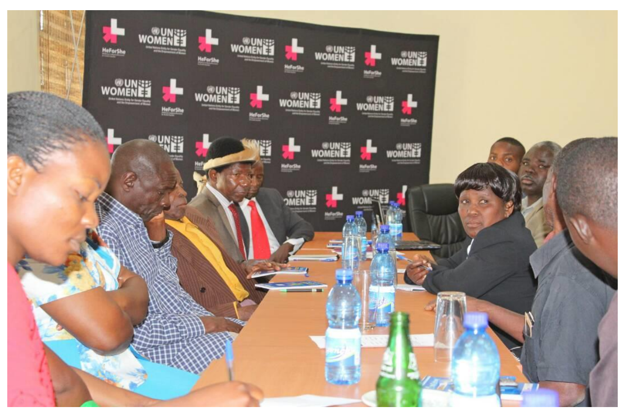
Chiefs meetings on gender responsive bylaws that promote girl's education- Dedza and Mangochi Chiefs

A key outcome of the meetings was that action plans were developed and participants agreed to implement several strategies to contribute towards achieving the project specific outcomes of improving the retention of girls in primary school and to address challenges that keep girls out of school.