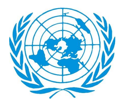
Terms of Reference for UN Secretary-General's Haiti Cholera Response Multi-Partner Trust Fund (UN Haiti Cholera Response MPTF)