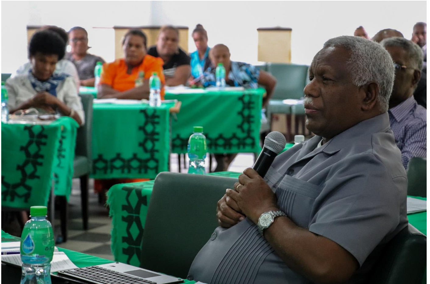
Prime Minister Rick Houenipwela responds to women's policy interventions at the dialogue in Honiara, Solomon Islands on 20 June 2018.

In his closing remarks, Prime Minister and MP for Small Malaita Rick Houenipwela said the participating MPs share the women representatives' desire to progress the interventions.