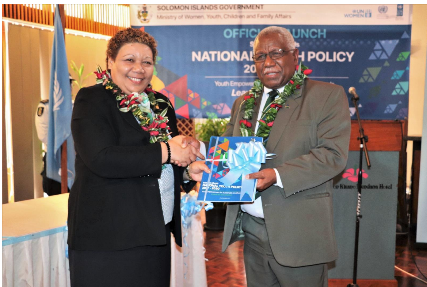
Minister of Women, Youth, Children and Family Affairs Honourable Freda Tuki and Prime Minister Rick Houenipwela launch the National Youth Policy in Honiara on 24 August 2018.