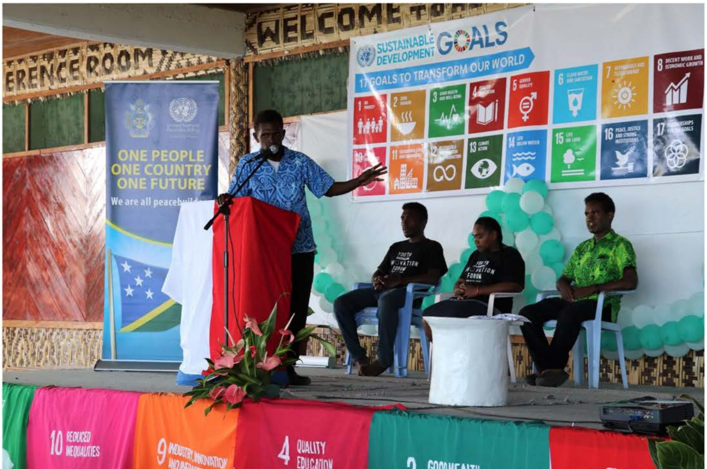
The Stone Raisers team pitches their prototype at the Youth Peacebuilding Innovation Forum in Auki on 6 September 2018.

Auki, Solomon Islands, 7 September 2018 – The Youth Peacebuilding Innovation Forum in Auki, Malaita Province aimed at helping young people use innovation to spark change in their communities concluded yesterday.