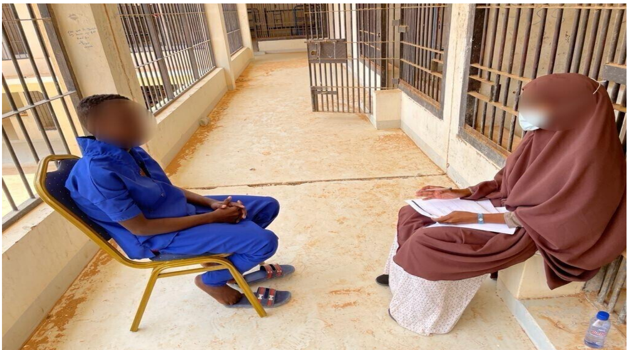
A female social work student counselling a prisoner