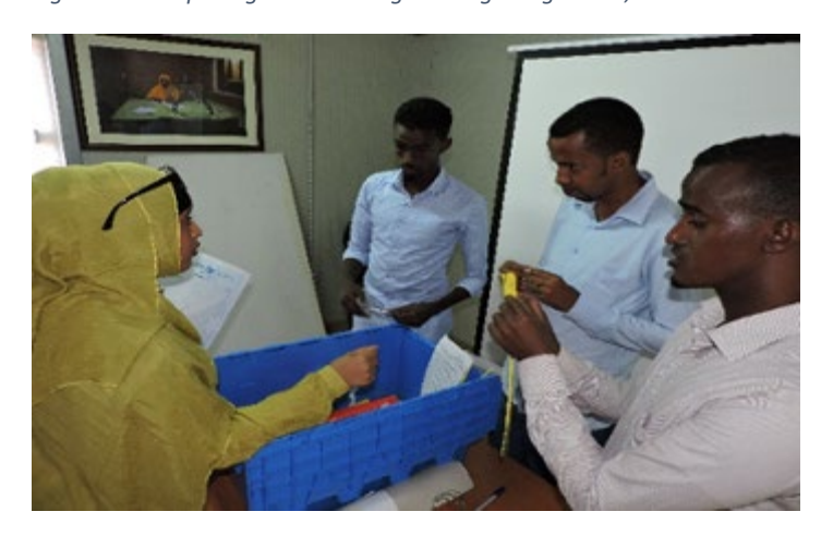
Figure 10: NIEC workshop on political party registration with representatives of African and Arab EMBs. Nairobi, 10-12 July 2017.