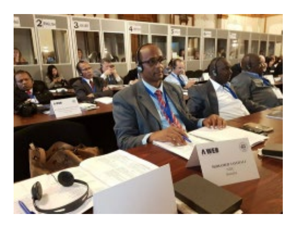
Figure 6: MoIFAR Working Group session (ETF)