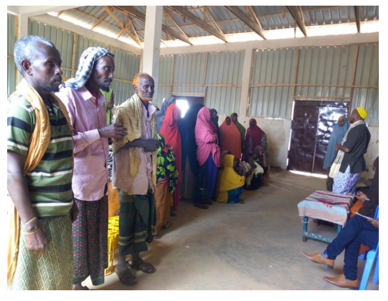
Baidoa Maka Dhagol IDP camp, 2018.

Mobile courts have been instrumental in providing legal aid to areas that were previously isolated from the reach of the justice providers. The mobile court system was established by the Puntland Judiciary in 2009 with support from UNDP, and with funding from the European Union and United Kingdom. The mobile court teams, which are made up of lawyers, judges, prosecutors and registrars, continue to deliver justice to rural and IDP communities, who for reasons of distance, lack of accessibility and absence of courthouses, would otherwise not have had access to the formal courts.