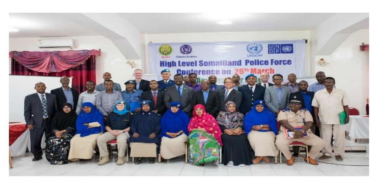
Picture 1: Hargeisa hosts high-level Police Force Conference, 26<sup>th</sup> March 2018.