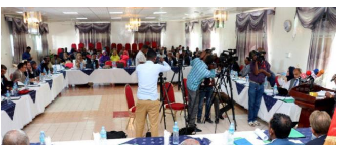
Justice and Corrections National Conference 29 January 2018.