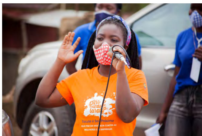
Social activist raises awareness of GBV during the COVID-19 pandemic