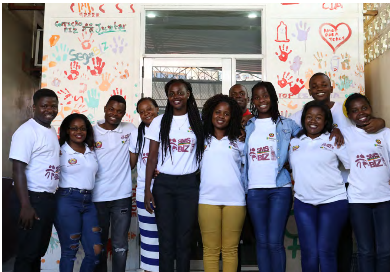
SMS Biz youth counsellors pose against a mural alluding to the elimination of violence and the promotion of sexual and reproductive health and rights.

Investment in counselling services. A sub-regional hub for SMS BIZ/U-Report 6 has been established and equipped with IT equipment, an activist manual and a frequently asked question guide. The centre has also recruited 20 counselors (55 per cent female) who were trained and equipped to provide at least 30,000 monthly answers to questions on HIV prevention, GBV, child marriage and other issues asked by adolescents and young people. By the end of December, SMS BIZ successfully expanded its coverage to all districts of the three Spotlight target provinces. As a result, 320,205 people (51 per cent male and 49 per cent female; 16 per cent aged 5-17) accessed counselling services via SMS BIZ/U-Report .