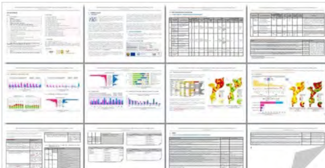
Fig. 1: Snapshot of the seminar's report