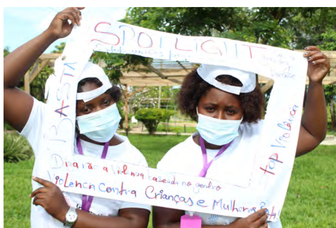
Girls share their thoughts on violence during a training session in Manica province, Mozambique