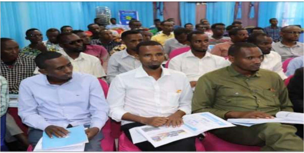
Photo 1: Public Consultation and handover of second draft of the constitution to the president in Southwest state