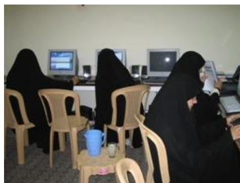
Civil Society Development Project – Basra

6.E Adults Skills enhancement and social awareness in Sulaimaniyah : 182 residents of 12 villages in Sul. received several trainings: