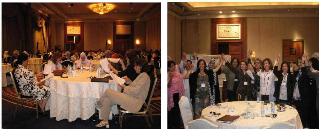
Working with Middle East NGOs to

6.I Iraqi Women's demands gaining Iraqi and international attention: The conference on Women's Rights and the constitution organized by MPDL , that came after 2-three day workshops, gained the Iraqi and international attention and interest: