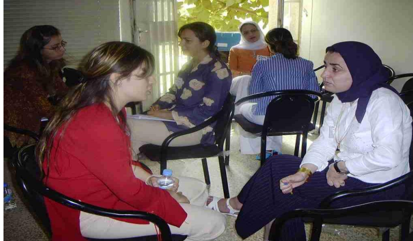
Anti Violence Program - Erbil, Sulaimanieh and Dohuk.

6.A An Anti violence program in Dohuk and Erbil: A program implemented by Concordia in Kurdistan for setting up 20 counseling centers in Dohuk, Erbil and Sulaimanieh governorates. 140 women learned to be Psychosocial trauma counselors for women victims of violence. Thousands of people around northern Iraq are aware (through T.V advertisement) that counseling is available to local women through this program.