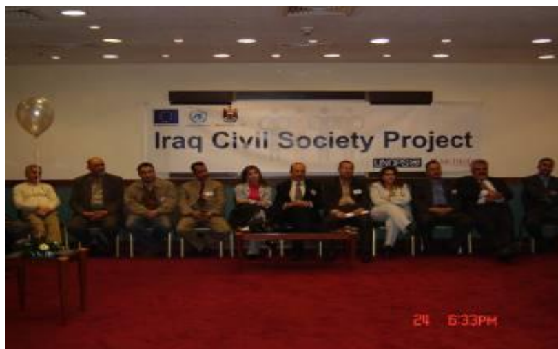
The project management workshop / Feb. 05