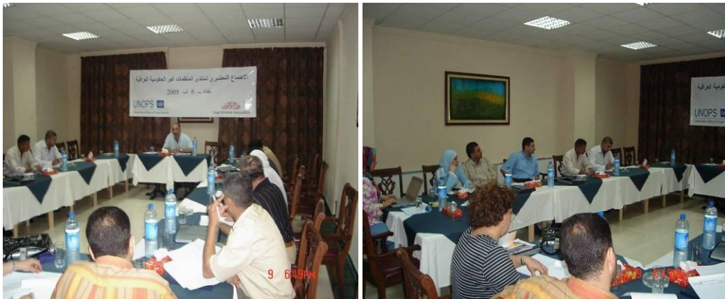
Iraqi Non Governmental Organisation Forum - Baghdad

6.H The Study on the legal framework for Local NGOs made by a UN Consultant, has been used and further revised, discussed and amended during a roundtable of 90 participants organized by AL Amal Iraqi Organization. The study will be submitted to the Civil Society Committee / National Assembly to have it endorsed.