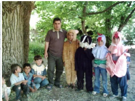
Women and Adult's Skills enhancement program - Sulaimanieh