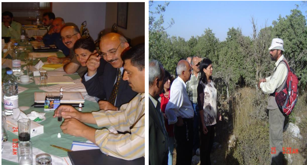
Iraqi Environmental NGO Roundtable Meeting

6.G Exposure to other experiences for Iraqi environmental NGOs : A survey is already conducted on the status of Iraqi environmental NGO's. 12 Iraqi environmental NGOs are exposed to international and regional groups for further expanding their knowledge and future networking, through attending workshops and seminars.