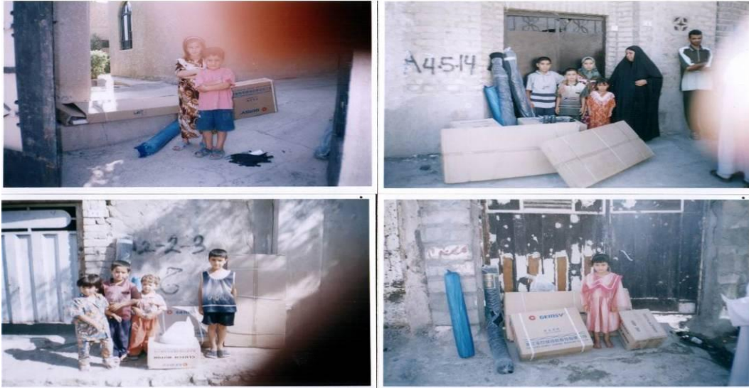
Income Generation Activities to Support Civil Society in Fallujah

6.F Fallujah Community Restructuring: Income generation project (ICS): 35 families, primarily in Fallujah have been assisted to reclaim their lost businesses (Aid in Kind). Preference was given to Widows, Families with a large number of children, Disabled, and Women head of families