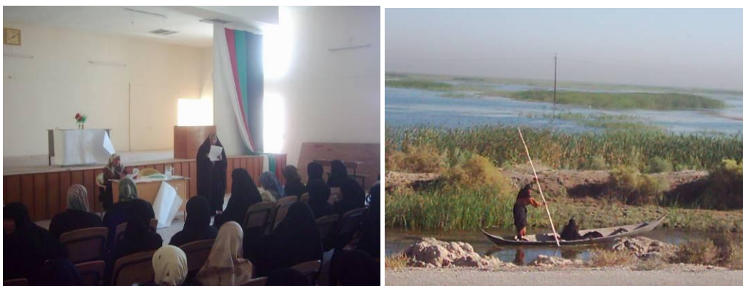
Empowerment of women in the city of Nasiaryah, the rural areas and the Marshlands

6.B A Women Awareness Program in the Marshlands (the Independent Iraqi Women Organisation in Nasiaryah): In addition to the 13 locations in the cities of Nasiriyah, our women awareness program targeted 15 different locations in the marshlands and rural areas with the number of 1250 direct beneficiaries.