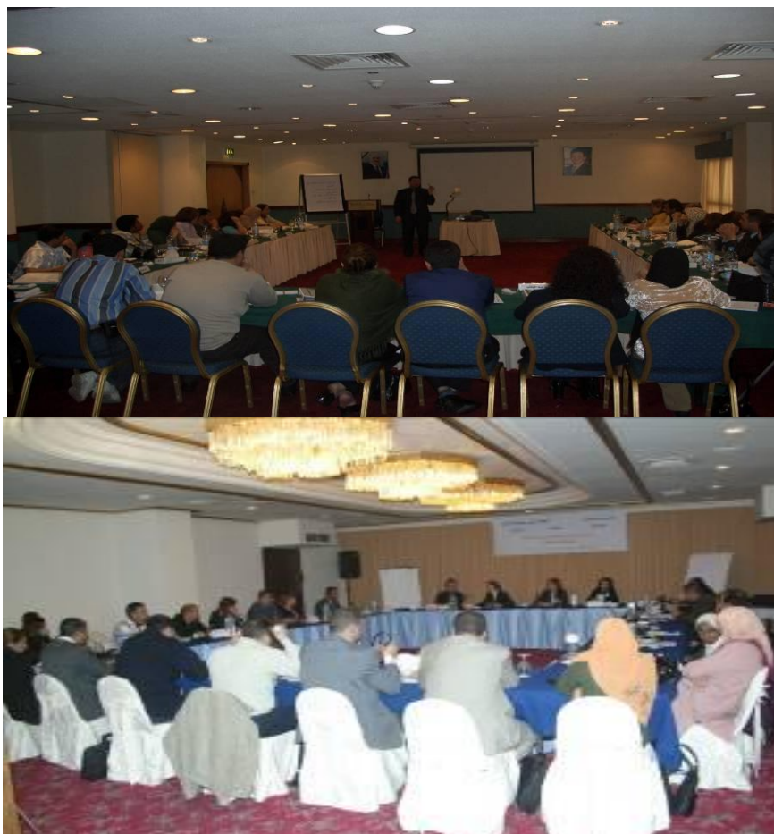
Training of Trainers – Amman