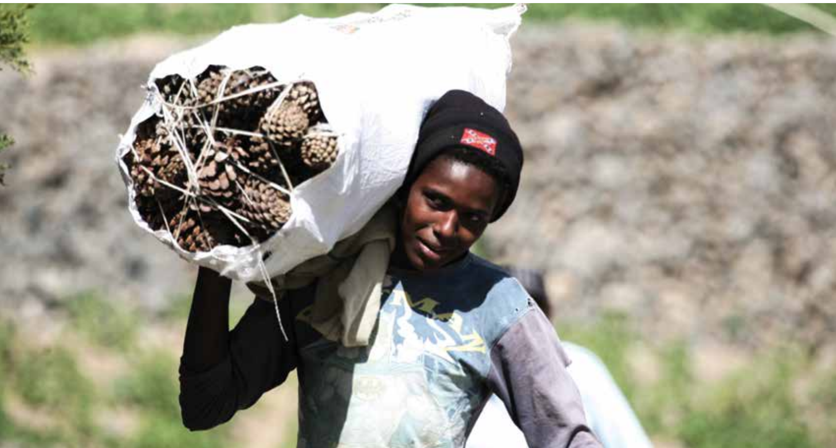
Promote sustained, inclusive and sustainable economic growth, full and productive employment and decent work for all – Cape Verde