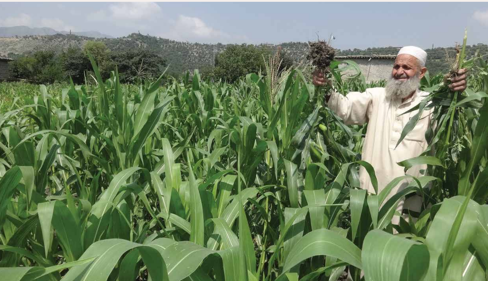
End hunger, achieve food security and improved nutrition, and promote sustainable agriculture - Pakistan