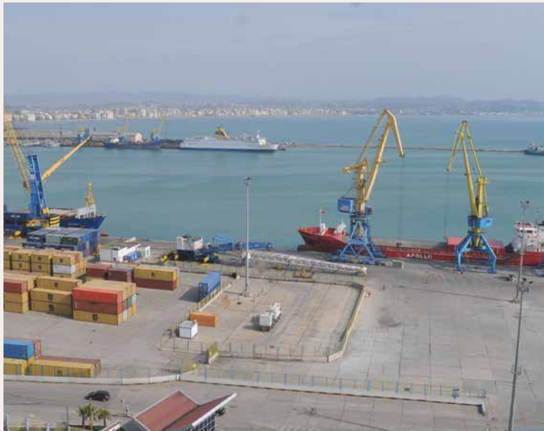
Build resilient infrastructure, promote inclusive and sustainable industrialization and foster innovation - Albania

issues, including entrepreneurship, development and investment. A brainstorming session focusing on policy advice for SMEs was organized with Bhutanese national authorities. The workshop to implement the UNCTAD e-Regulations System was also organized for national stakeholders to better understand the possibilities of creating and developing SMEs through simplified business modalities. Complementing this work through the training of government staff in research methodologies and data analysis, UNDP is supporting governments and national institutions as they conduct labour market analyses.