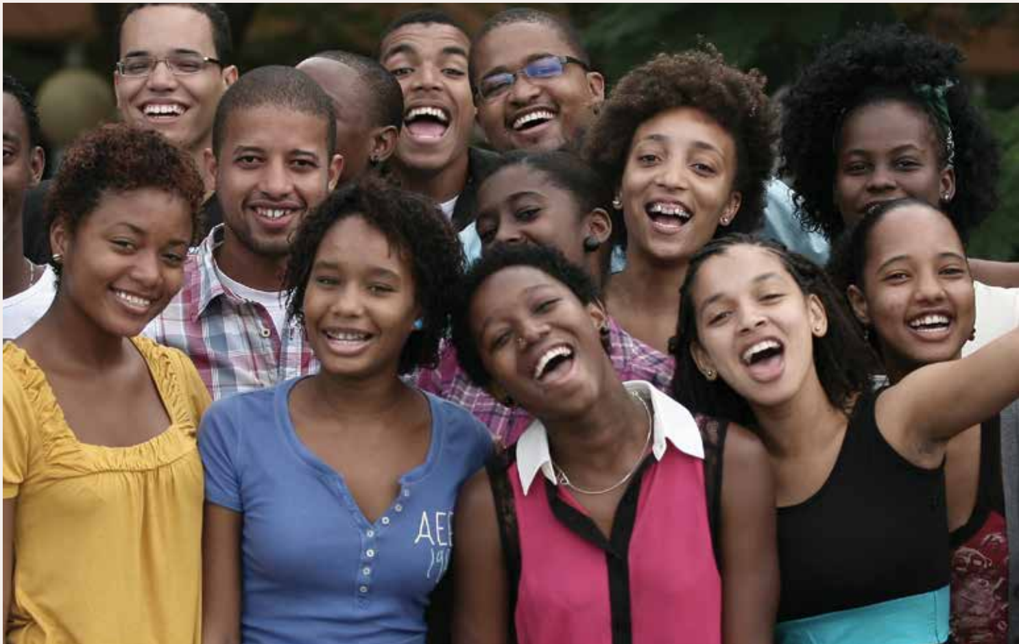
Promote peaceful and inclusive societies for sustainable development – Cape Verde

Rwanda – Ahead of the country's next Universal Periodic Review on human rights in November 2015, the One UN focused on building the capacities of national stakeholders in the implementation of UPR recommendations by providing training on the UPR process and reporting requirements. As a result of One UN support, all UPR reports due in March 2015 were duly submitted, including a parallel report prepared by a coalition of 25 CSOs, the UPR report submitted by the National Commission for Human Rights, as well as the UN Compilation.