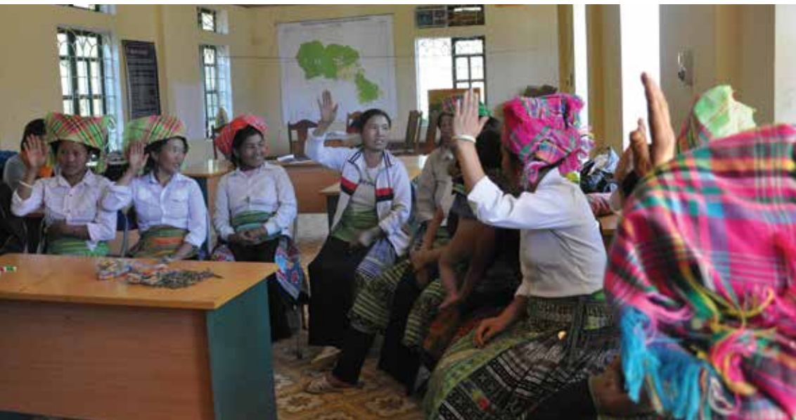
Reduce inequality within and among countries - Vietnam