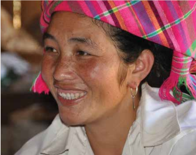
UN supported consultation with ethnic minority group members in Vietnam