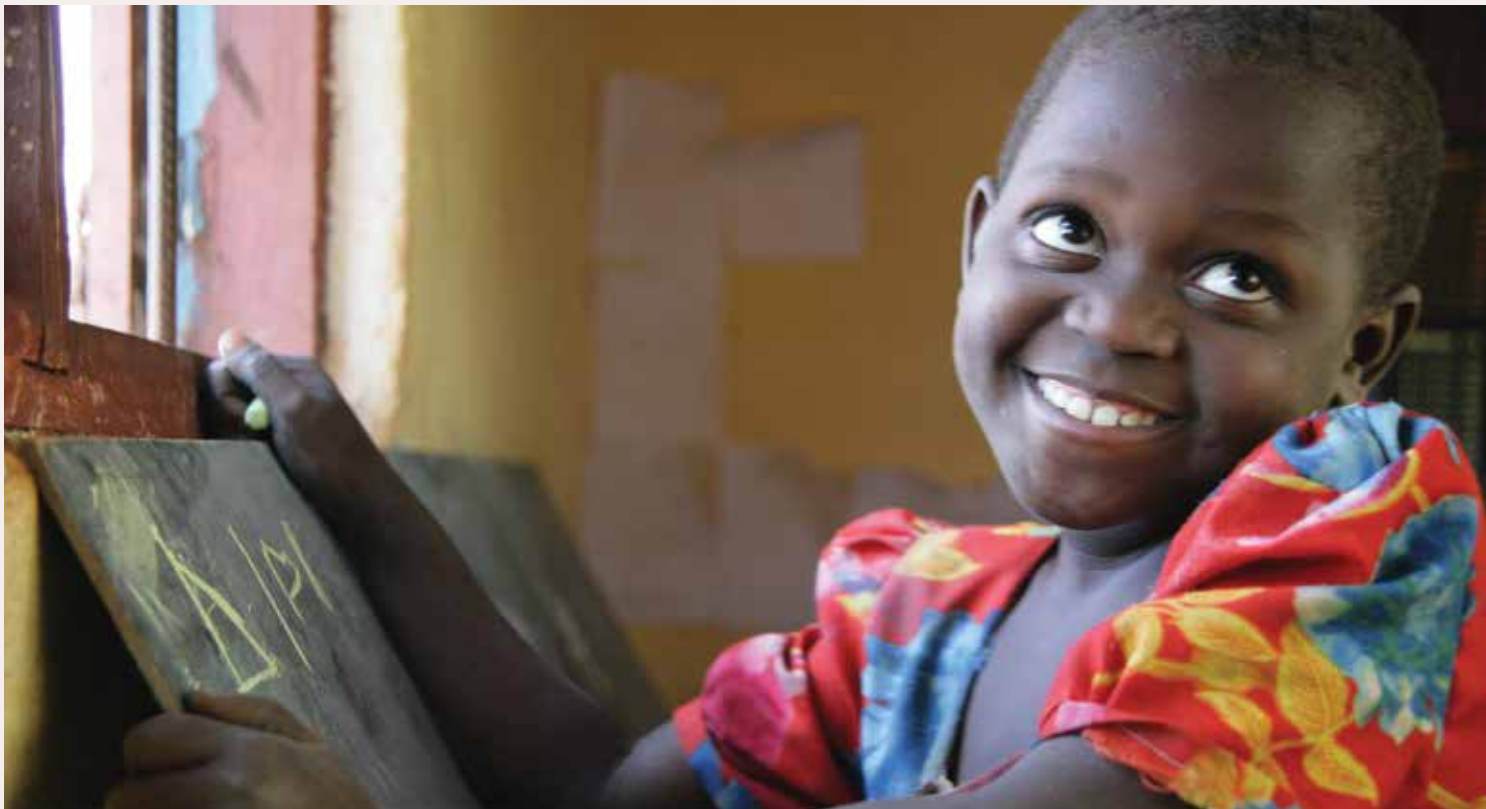
Achieve gender equality and empower all women and girls – Photo by: Resident Coordinator's Office Malawi

policy analysis and insightful advice as well as technical and scientific data to support the different recommendations. DRT-F funds are supporting the Central Election Commission in establishing a 'Regional Network of Electoral Management Bodies, with special focus on more gender-sensitive electoral management in the region and beyond'. UN Women and UNDP are together helping government to develop the new National Strategy on Gender Equality, Eradication of Gender-Based Violence and Domestic Violence (NSGE-GBV&DV). An Action Plan has been developed; it focuses on the implementation of the previous strategy and emphasizes the central objectives of the strategy in line with the Convention on the Elimination of all Forms of Discrimination Against Women (CEDAW).