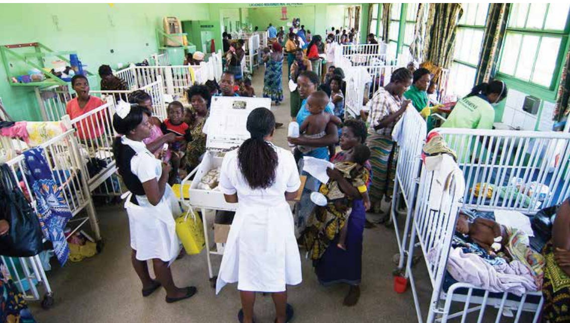
Ensure healthy lives and promote well-being for all at all ages – Malawi