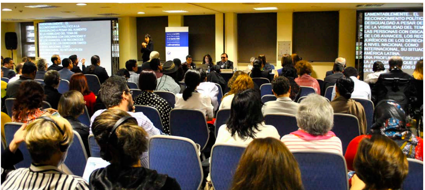
Participants during plenary session of the Sao Paulo Conference

In the discussion, reference was made to the 2030 Agenda, which was approved in New York, and to the importance of working across all aspects of the 2030 Agenda in order to improve implementation of the UN CRPD.