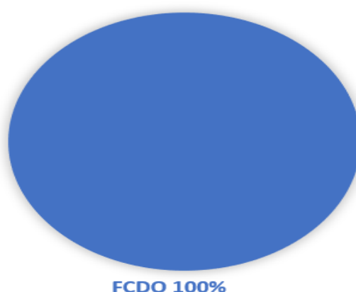
Figure 1: Deposits by contributor, cumulative as of 31 December 2020