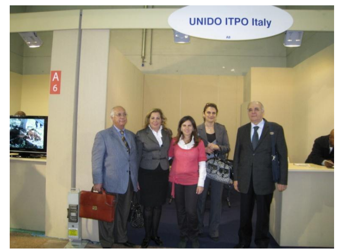
Lebanese Participants attendant the EIMA exhibition.

EIMA international is one of the most important exhibitions of farm machines and it became the main observatory of the agriculture mechanization, from tractors and combine harvesters to equipment