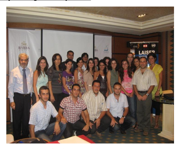
Training of trainers Workshop at Riviera Hotel, Corniche el Manara

The second stage consisted of an onsite implementation module that focused on each individual enterprise rather than on groups. The implementation of relevant standards and systems was followed, step-wise, in accordance with the specified field and monitored by UNIDO office expert.