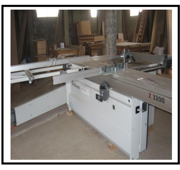
Panel Saw at Est. AL Porsh Company, South of Lebanon, as part of the (LAISER) project.