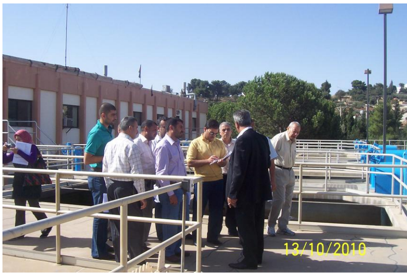
TOT on Sanitary Inspection Amman-Jordan