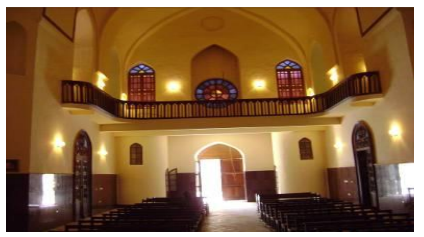
Interior of the Al-Lateen Church in Baghdad

Phase II was to include the rehabilitation of a church as identified in the Project Document with