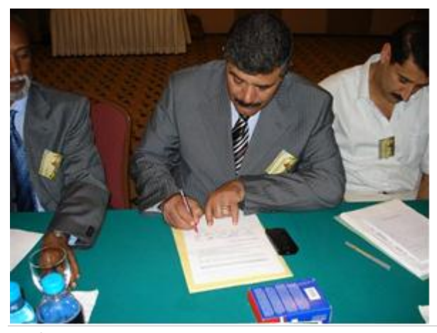
Figure 1 The Governor of Salah-al-Din signing the Endorsement Letter for the Samarra Development Agenda

Participants went back to their represented groups to further define and mature the issues and continued to conduct feedback sessions and group meetings over the next two months. This process resulted in the production of the Samarra Development Agenda which is a distillation of the priorities with consensus reached. The Samarra Development Agenda was then endorsed by the key decision makers.