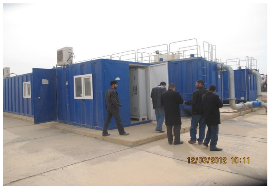
The final inspection at Samarra Water Treatment Plant