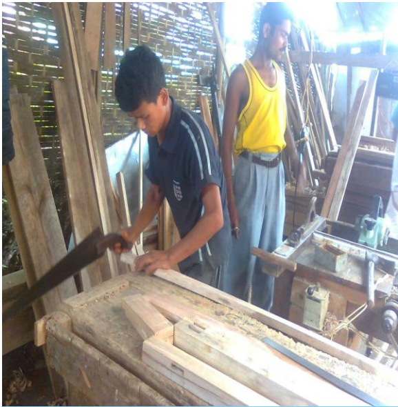
Former CAAFAG self-employed after receiving IGA support