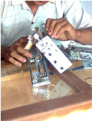
Former CAAFAG in training