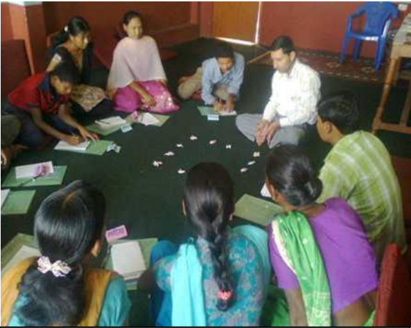
Entrepreneurship training for CAAFAG/CAAC