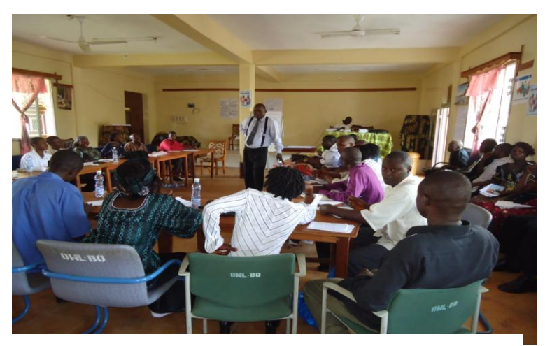
Principal State Counsel facilitating training for FSU Police Investigators in Southern Province