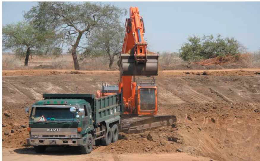
Public Works equipment, Eastern Equatoria State © UNDP/Joris Magenti.

In Eastern Equatoria, the SSRF has provided funding for the construction of four county headquarters being implemented by UNOPS. Nearing completion, the county headquarters will be a permanent base of operations for county authorities to enhance service delivery to the people of Kapoeta North, Kapoeta South, Lopa/Lafon and Magwi counties, and assist the government to better respond to security incidents in their respective areas of responsibility. The approved additional resources will be used to provide solar power and water supply to