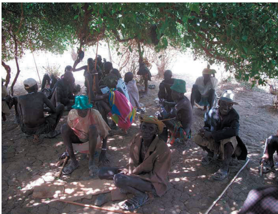
Community meeting in Eastern Equatoria State

Oversight and steering of RSF implementation will be streamlined under existing UNDP policies, procedures, regulations and rules, as well as will follow the existing governance arrangements of the SSRF, with the primary focus to provide a rapid response to emerging stabilization needs. A key facet of the RSF is to increase impact of complementary programmes. As a flexible facility, it is able to directly support the activities of partner programmes, where gaps and needs exist.