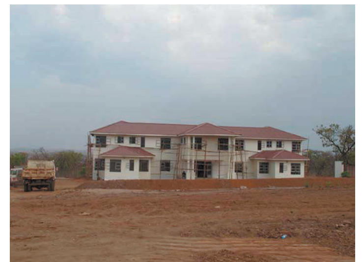
Magwi County, Eastern Equatoria State

The United Nations Office of Project Services (UNOPS) is putting the final touches on four county administration buildings in Eastern Equatoria State. Once completed, the four buildings will serve as the county seat for Lopa/Lafon, Kapoeta North, Kapoeta South and Magwi counties in the state. Prior to the construction of the county headquarters, county authorities often sat underneath trees to serve their constituents and follow-up has proven to be an immense challenge. The new structures, equipped with solar panels, and water sources, will house such departments such as Agriculture, Cooperatives, Health and Community Development. Their construction, as part of the SSRF-funded Eastern Equatoria State Stabilization Programme, is part of plans by the state government and development partners to improve and extend service delivery to the people of Eastern Equatoria State.