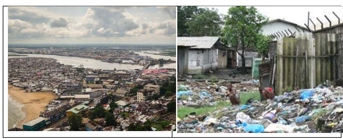
West Point and Clara Town Slums - Monrovia

As shown in the Map at Appendix III , the main pipeline for the municipal water supply system traverses the northern and western boundaries of Clara Town, which makes it technically feasible and cost effective to extend the public water supply system to serve the residents of the town, through public water points which can be managed by youth groups under a delegated management framework.