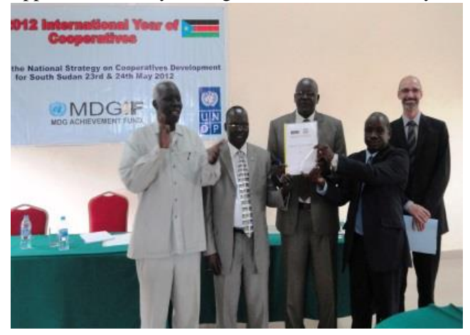
Launch of South Sudan National Cooperatives Strategy, supported under YEP, in Juba, May 2012.

The initial design of the joint programme aimed to: (i) provide skills development and livelihood opportunities for youth aged between 15 and 30 years in both Northern and Southern Sudan; and