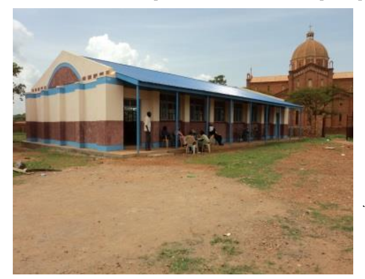
Wau Youth Training Centre, renovated through YEP in 2010

Section b above outlines the approach to non-formal adult education introduced to South Sudan by the JP. The decision to move away from formal education and vocational training was arrived at through the participatory approach adopted by the joint UN and government inception mission at the start of the JP (April-June 2010). Some 344 participants (277 males and 117 females) were