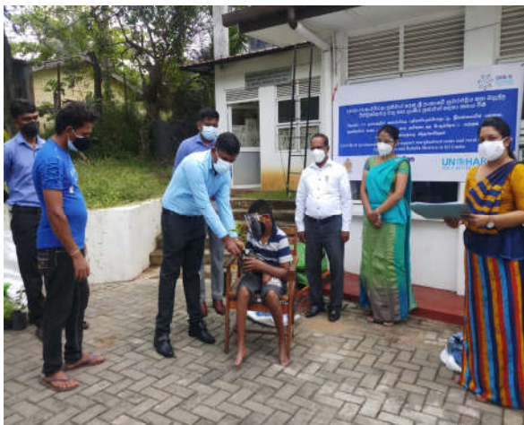
The distribution of home garden inputs to person with disability at Hanguranketha DS Division