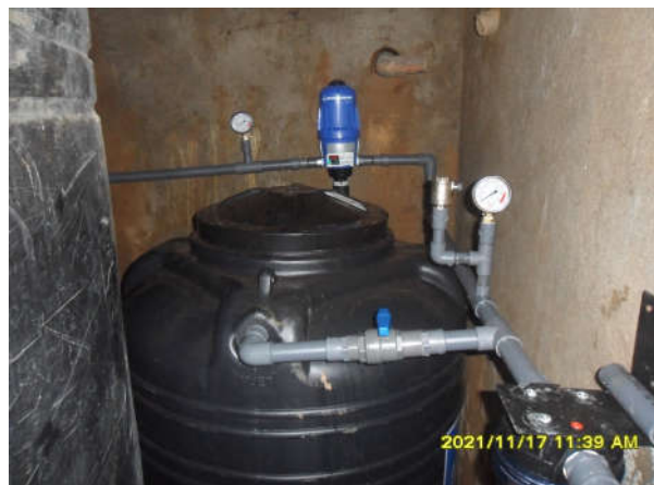
Non-electrical dosing pumps installed in water purification plant at Saliyapura Upper Division in Hanguranketha DS Division