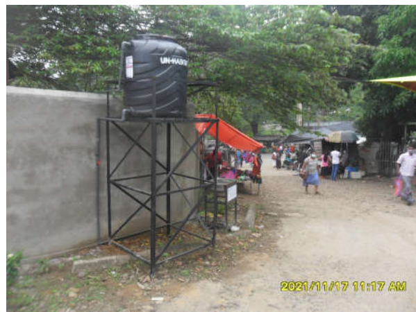
Hand washing station installed at the Sunday Fair – Hanguranketha DS Division