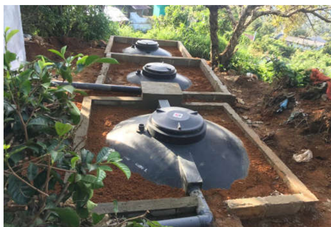
Sewerage treatment system installed at Nayabedde estate, Bandarawela DS Division

The interventions mentioned above ensured that all preliminary activities were completed ahead of schedule and construction completed by the end of the project. At the time of reporting, all project activities have been successfully completed within the stipulated project time schedule as depicted in the pictures below.