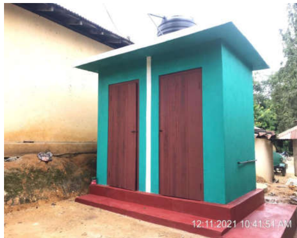
Twin toilet constructed at Wewesse estate –FMCHC, Badulla District