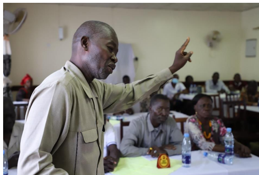
Discussion during the launch of the community Action for Peaceful Resolution of Housing, Land and Property Disputes and Conflict project in Wau.