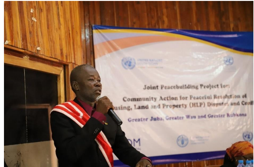
One of the community leaders speak during the launch event in Wau.