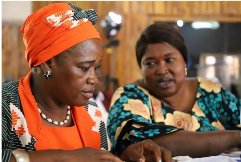
Women representatives at the launch of the project in Wau.