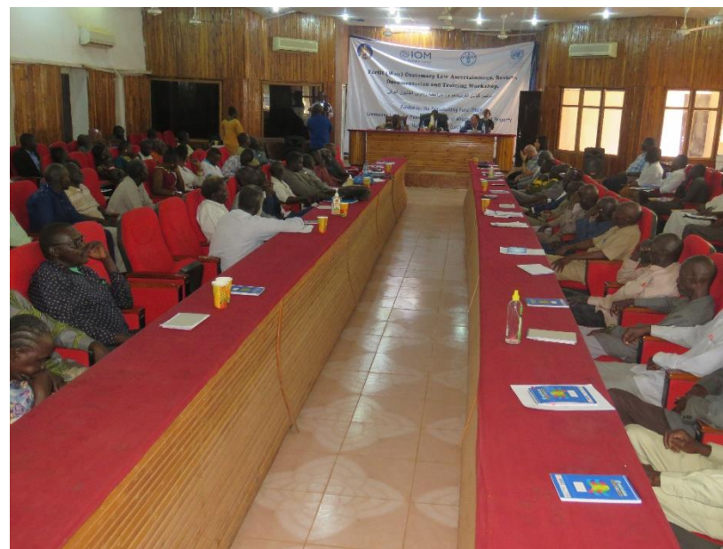
Participants at the Fertit Wau County Customary Law Validation Workshop in Wau.