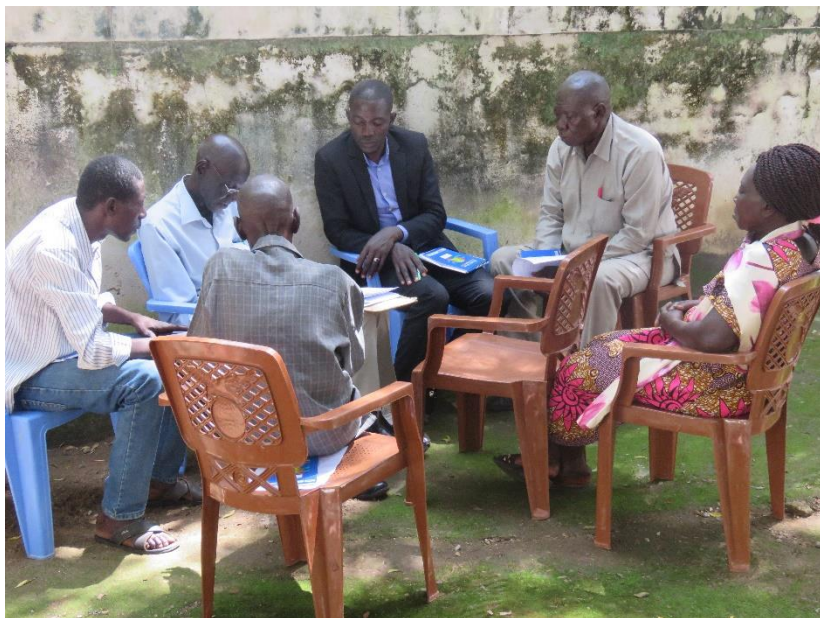
Group discussion during the Fertit Wau County Customary Law Validation Workshop in Wau.