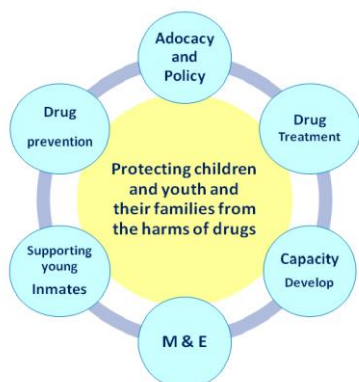
Figure 1 - Overview of the action on Output 1: Evidence-based and tailor-made drug use prevention, treatment, rehabilitation and social reintegration programmes, tools, and guidelines for children and adolescents are adapted, improved, and piloted

Provide support for developing a national strategic plan for drug prevention and treatment among children and adolescents [w UNODC and UNICEF] along with its launch and advocate for implementation of and scaling up of evidence-based interventions