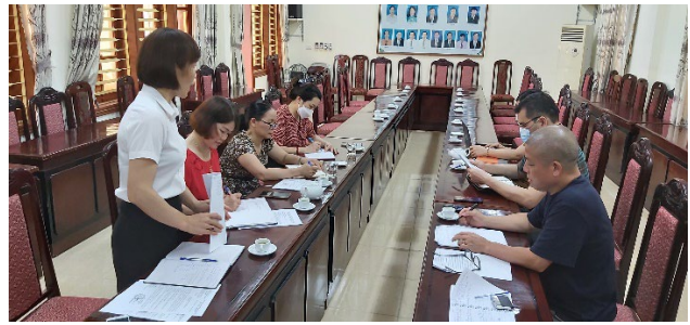
FGD with local authorities