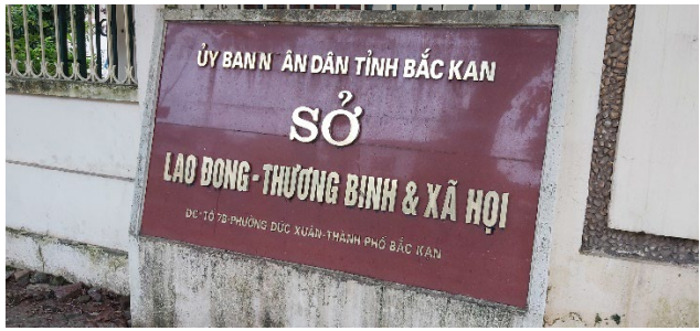
DOLISA Bac Kan province