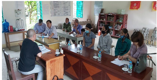
FGD with local beneficiaries