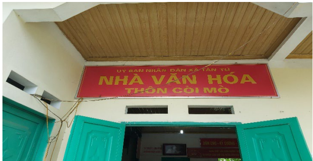
Tan Tu commune's public hall