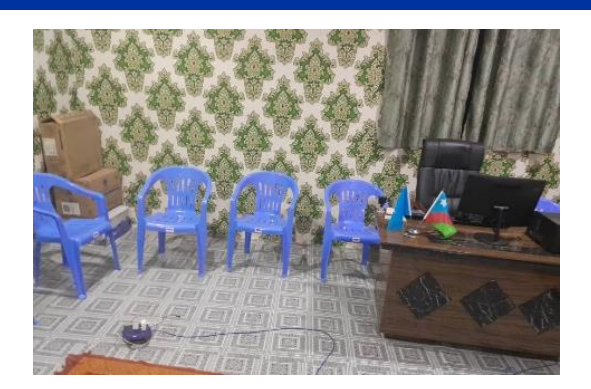
Before (left) and after (right) of furnishment