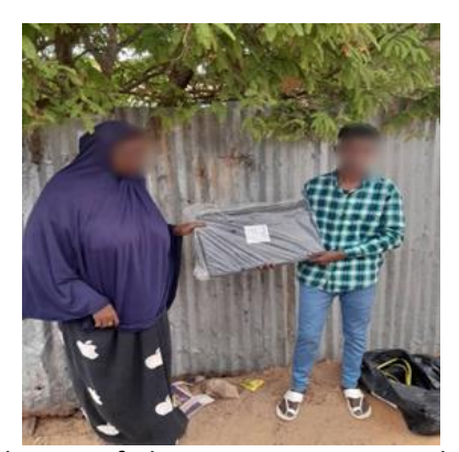
Distribution of plastic rain protection sheets