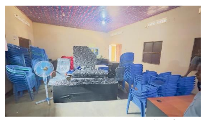
Furniture handed over to the youth office