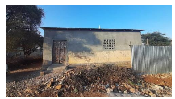
During (left) and after (right) renovation of mosque