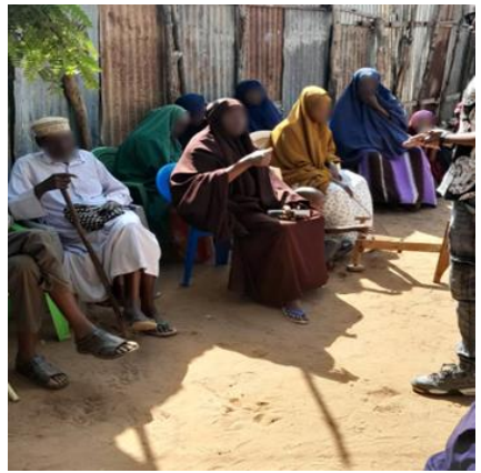
Voting event to select one project to be implemented