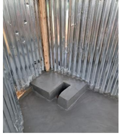
Exterior (left) and interior (right) of constructed latrines