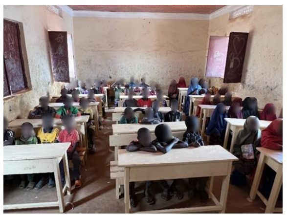
Chairs and desks installed in the classroom