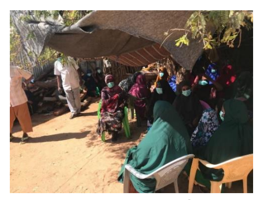
Project idea preparation workshop