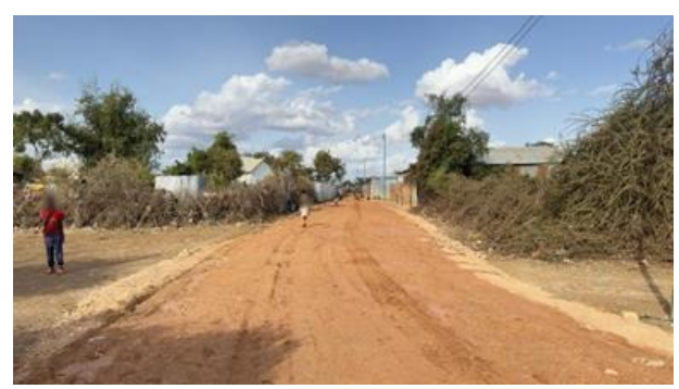
Before (left) and after (right) renovation of the road