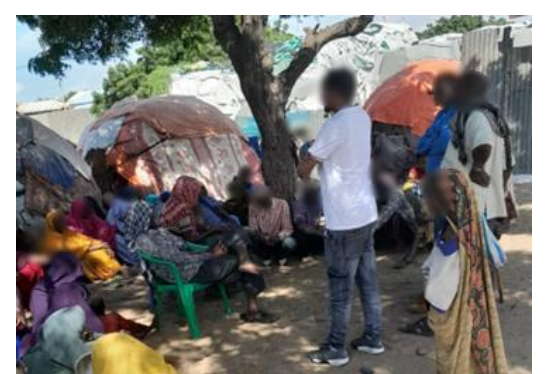
Voting event to select one project to be implemented