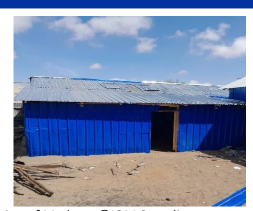
Before (left) and after (right) the rehabilitation of Madrasa