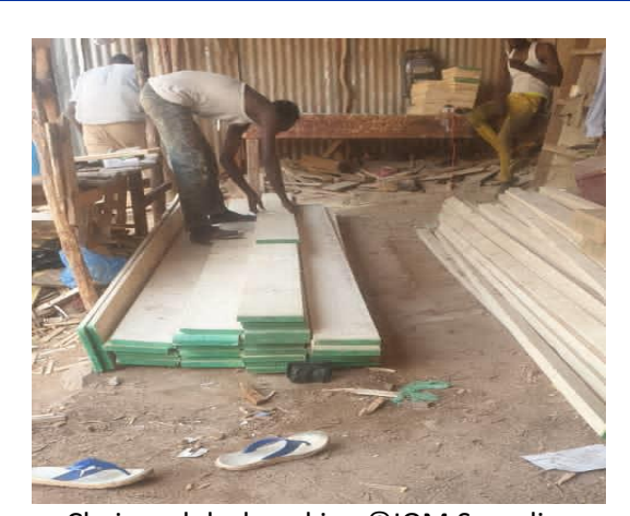
Chair and desk making