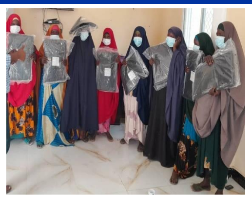
Distribution of plastic rain protection sheets