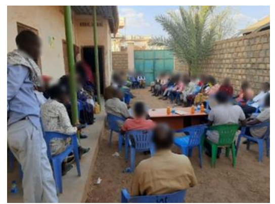
Introductory event to inform community about the activity