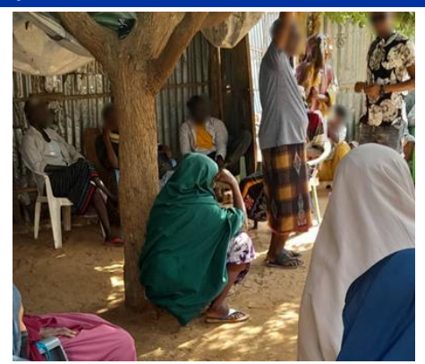
Community members brainstorming project ideas