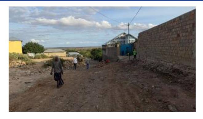
After maintenance of the road