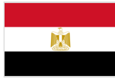
Government of Egypt