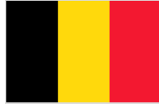
Government of Belgium