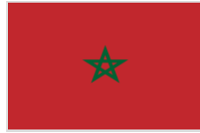
Government of Morocco