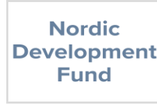
Nordic Development Fund