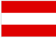
Austrian Development Agency