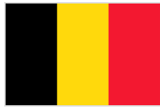
Government of Belgium