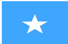
Government of Somalia