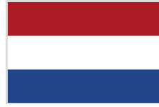
Government of Netherlands