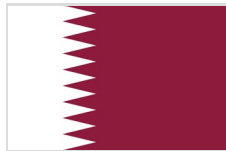
Qatar Fund for Development