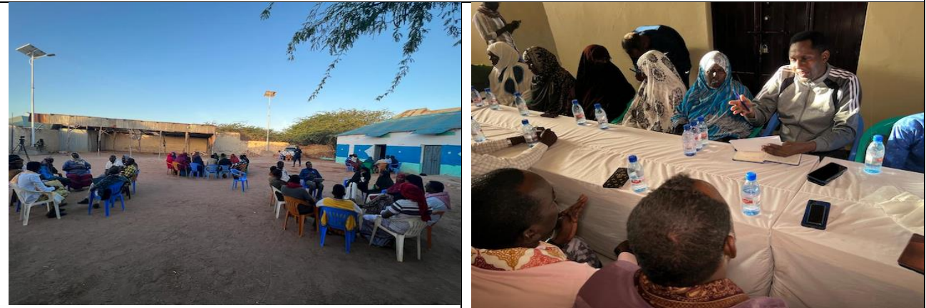
Community meetings held in Haradhere and Wasil