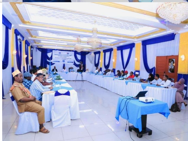
SOMALIA LAUNCHES NATIONAL ID SYSTEM AS MILESTONE IN STATE-BUILDING AND RECONCILIATION.