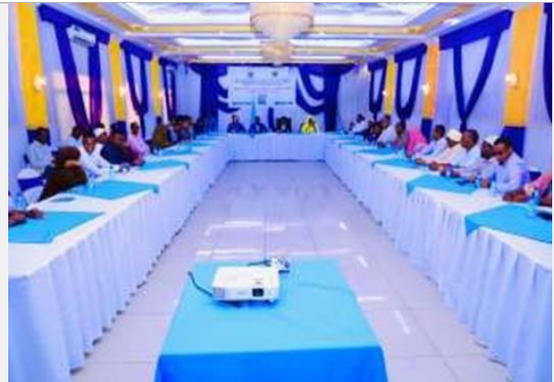
BRA DATA ENUMERATORS TRAINING TO EMPOWER SOMALIA'S CONFLICT RESOLUTION EFFORTS