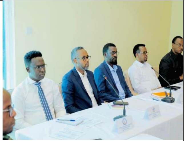
Galmudug Inter-Ministerial Committee Meeting on Stabilization Coordination of Galmudug