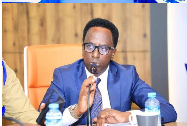
THE BRA LAND DISPUTE MANAGEMENT COMMITTEE HAS BEEN EFFECTIVELY EQUIPPED WITH SKILLS FOR MANAGING LAND DISPUTE CASES