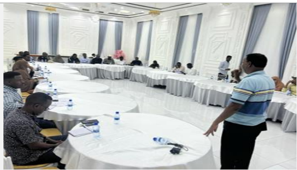
ESTABLISHING A MODEL DISTRICT IN THE BENADIR REGION