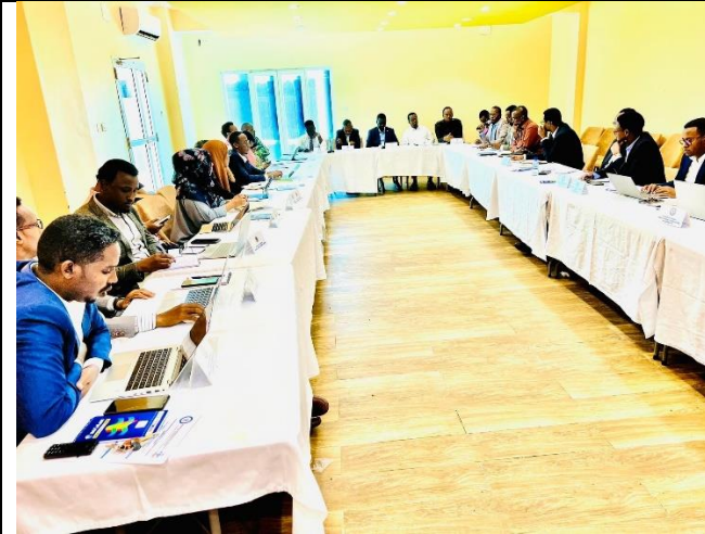
Consultation Session on Joint Planning and Assessment of Galmudug