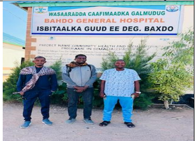
Government assessment team at Bahdo hospital.