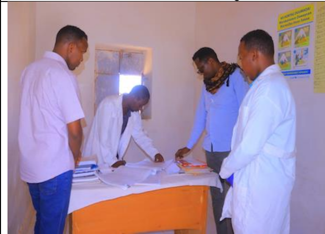
Health worker showing government assessment team patients registration process at Wisal Hospital.