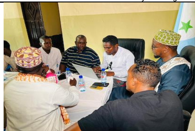
Government assessment team meeting local administration of Bahdo district.