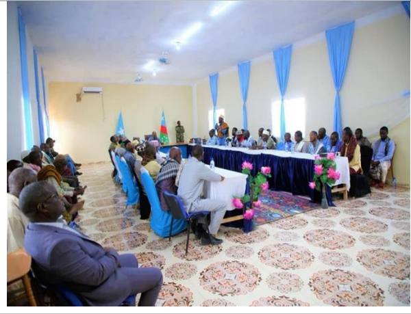
INSIDER MEDIATION AND CONFLICT RESOLUTION WORKSHOP IN HUDUR, SOUTHWEST STATE