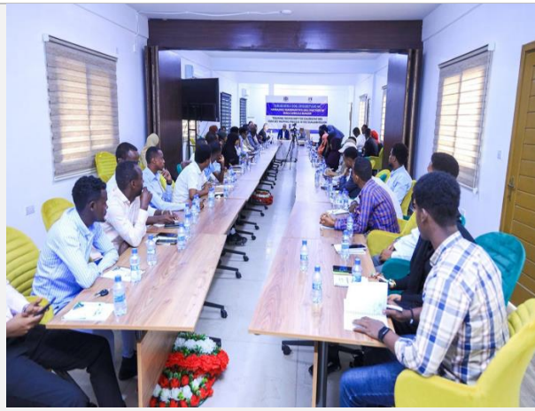
REVIEW OF THE BENADIR REGIONAL ADMINISTRATION'S SECURITY PROGRESS AND ACHIEVEMENTS