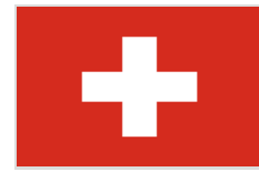
Government of Switzerland