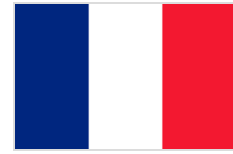
Government of France