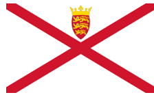
Jersey Overseas Aid