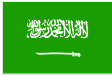
Government of Saudi Arabia