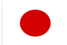
Government of Japan