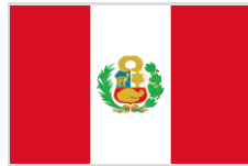
Government of Peru