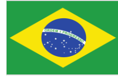
Government of Brazil