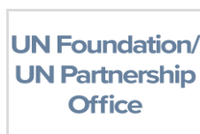
UN Foundation/UN Partnership Office