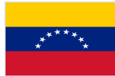
Government of Venezuela (Bolivarian Republic of)