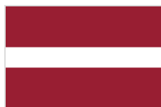
Government of Latvia