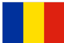
Government of Romania