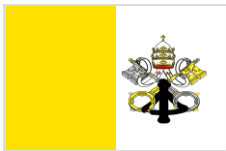
Government of Holy See