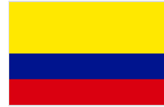
Government of Colombia