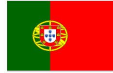
Government of Portugal