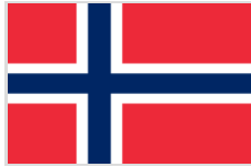
Government of Norway