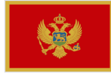
Government of Montenegro