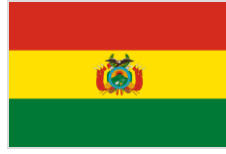
Government of Bolivia (Plurinational State of)