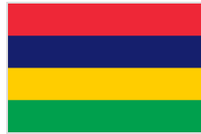
Government of Mauritius