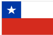
Government of Chile