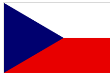
Government of Czechia