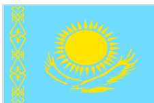
Government of Kazakhstan