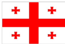
Government of Georgia