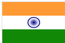
Government of India