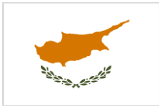
Government of Cyprus