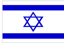
Government of Israel