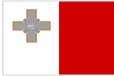
Government of Malta