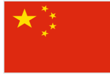
Government of China