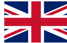
Government of the United Kingdom (other)