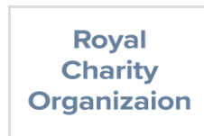
Royal Charity Organization