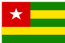
Government of Togo