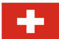
Swiss Agency for Development and Cooperation