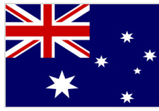
Government of Australia (Former AusAID)