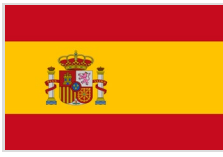
Government of Spain