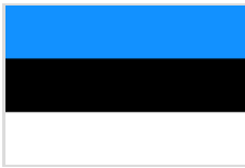
Government of Estonia