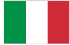
Government of Italy