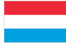
Government of Luxembourg