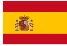
Government of Spain